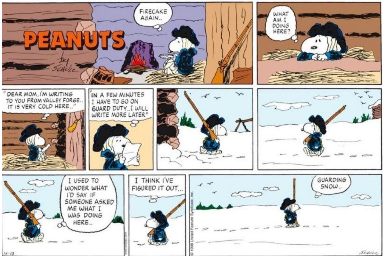
Snoopy Cartoon Courtesy of George Tonkin