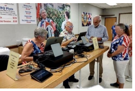
Point of Sales Systems

Unit Growth : $1,307 to host a Neighborhood Pool Party, inviting Ennisites to experience Tyrs Pool to bring in more people to our facility who will hopefully become members.