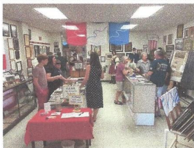
Visitors enjoying the Sokol's Czech Museum