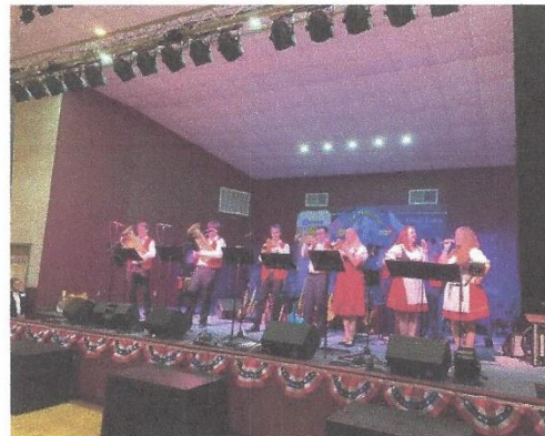
Pardubica Muzika performing on the Sokol Stage.