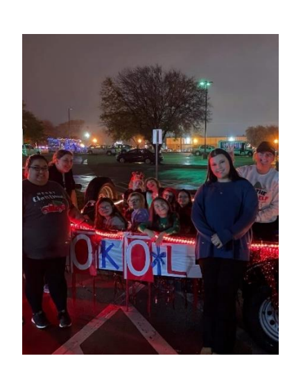
Member's Day Performance