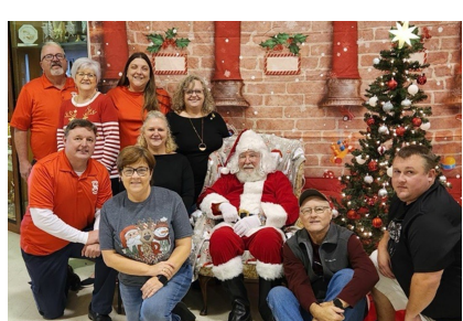
Santa & Executive Board Members