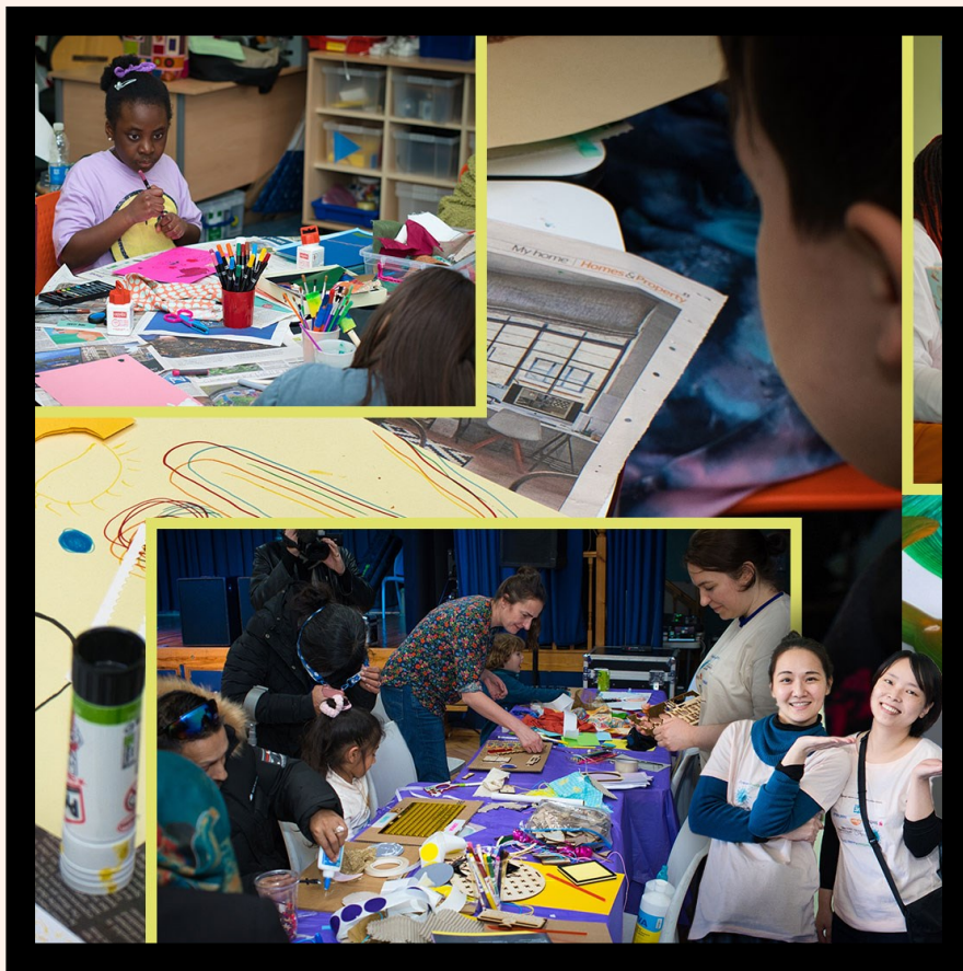
Picture, above: Showing scenes from the Dyslexia FeelGood Funday Festival , Saturday 9 March '24, Willesden London.