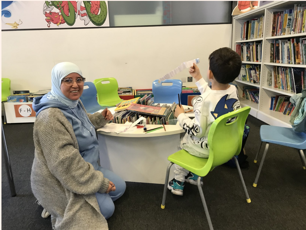
Picture: Family at Autism-Friendly Morning at the Library Willesden Green, London.