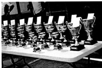
Top Effort Awards to Sunstate Panel Van Club.