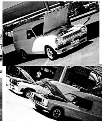
- 8 -