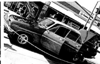
Sweet Aychar and Car of Show