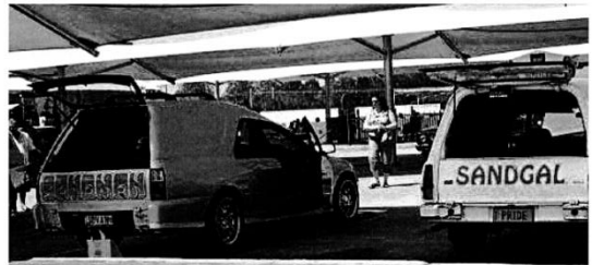
WOULD THAT MAKE SANDCOUPLE OR A SANDWICH?

The trophy list was endless and looked a million bucks. I don't have an official results list but the result is shown in a few photos here. Well done to Bernie and Karen for Van of show. Thanks to you Rob. Your enjoyment and sharing of photography and cars is growing in all of us.