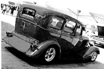
Top Hot Rod -- Really a little shy on the day.