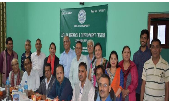
Asta-Ja Research and Development Center Kathmandu, Nepal January 8, 2018