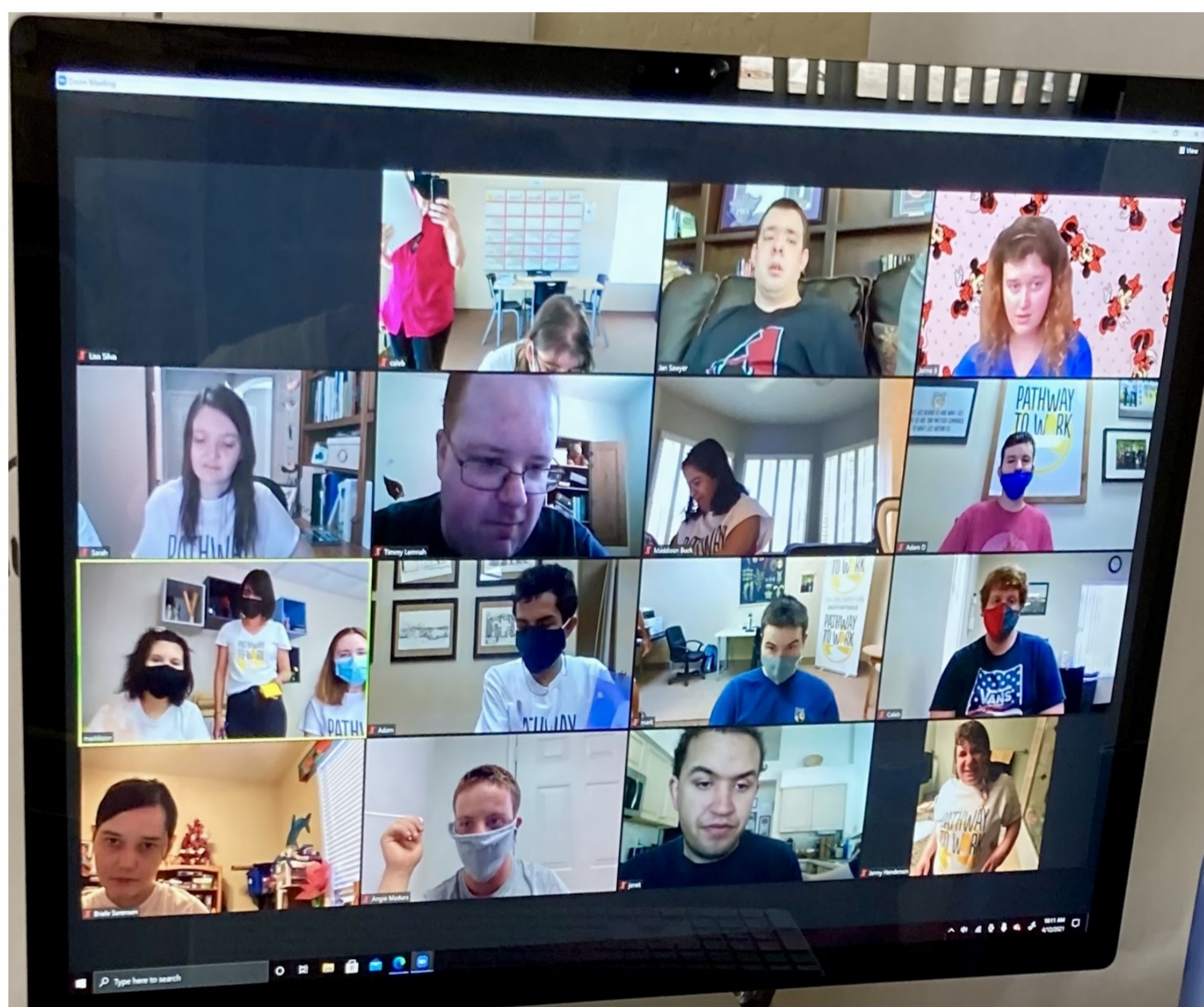
Ready to ZOOM!

2020 was anything but typical! However, our participants (and our staff) learned how to adapt and become resilient as we created new delivery methods for our programs in 2020-2021. We kept the learning and engagement going strong with a small cadre of (socially distant and mask wearing) participants in our facility, as well as a full (and growing) roster of online participants via ZOOM.