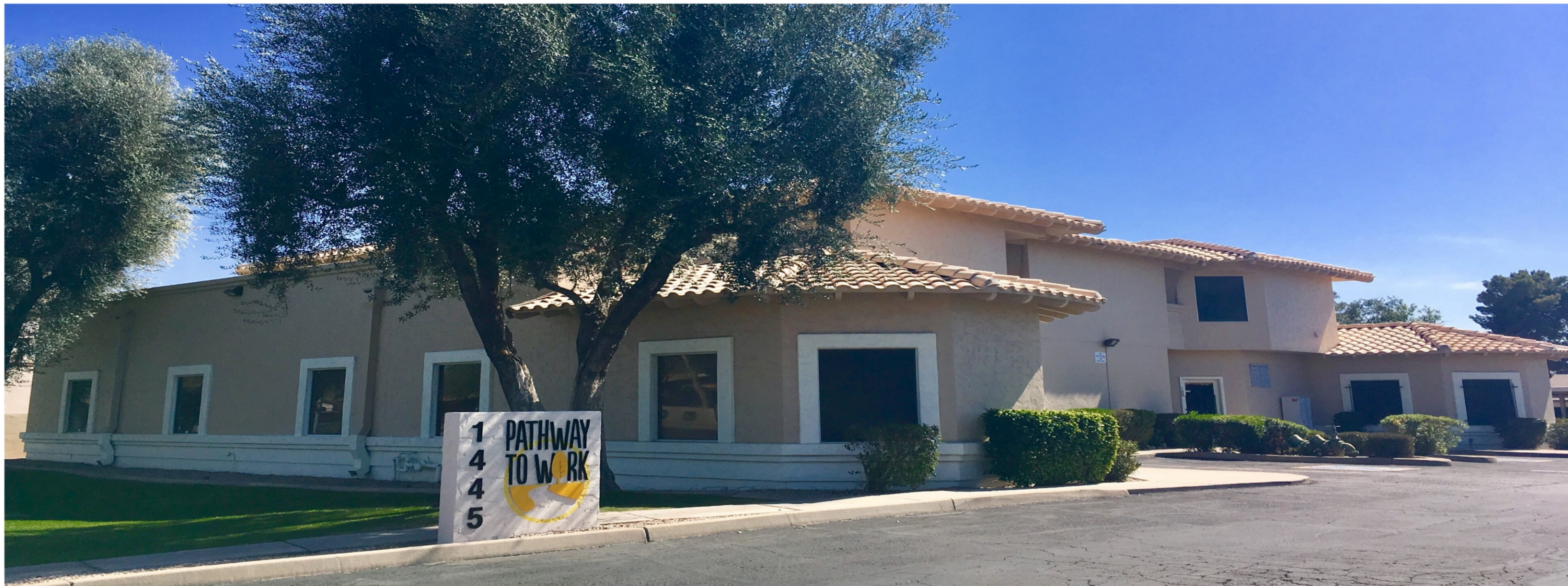
Pathway to Work Center in Tempe, Arizona.