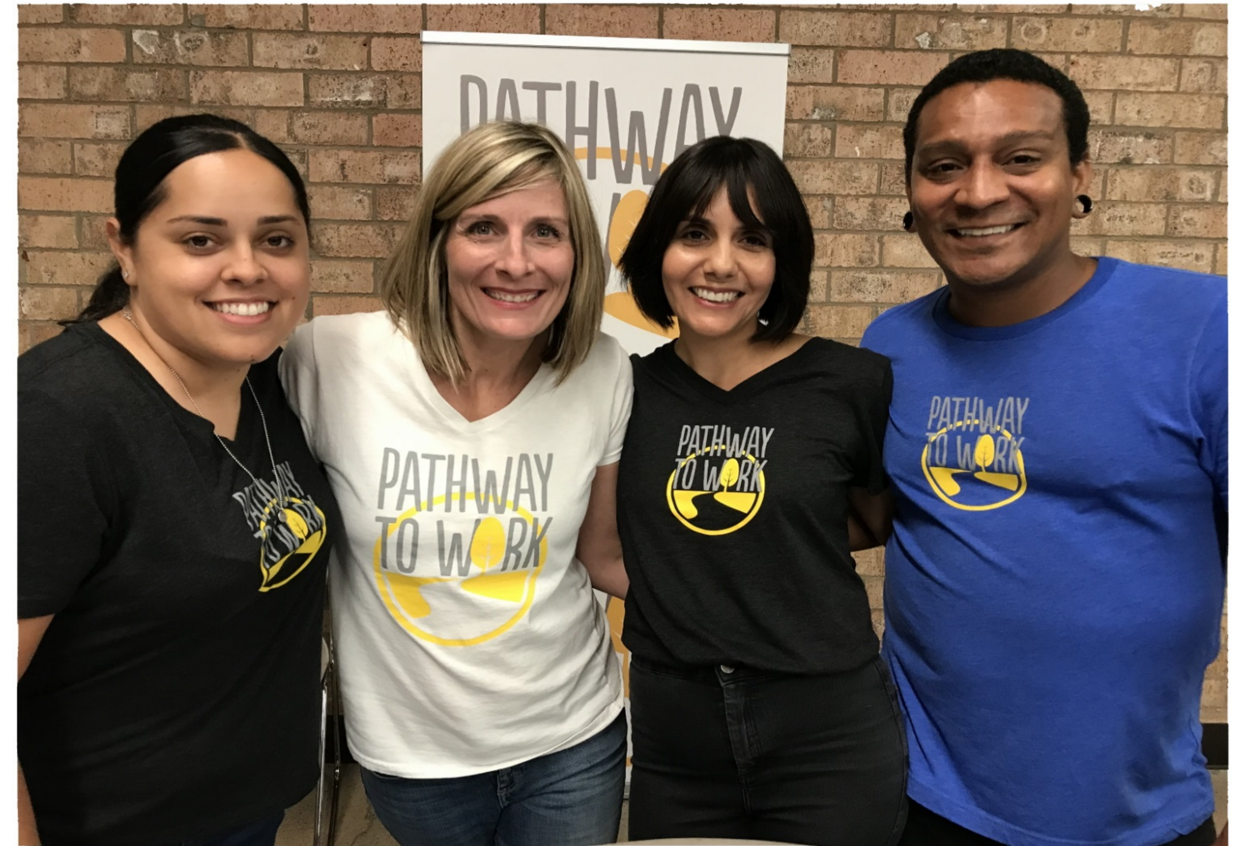
Our dedicated teaching staff is the heart of Pathway to Work!

2018 - 5 PARTICIPANTS 2019 - 15 PARTICIPANTS 2020 - 20 PARTICIPANTS 2021 - 25 PARTICIPANTS