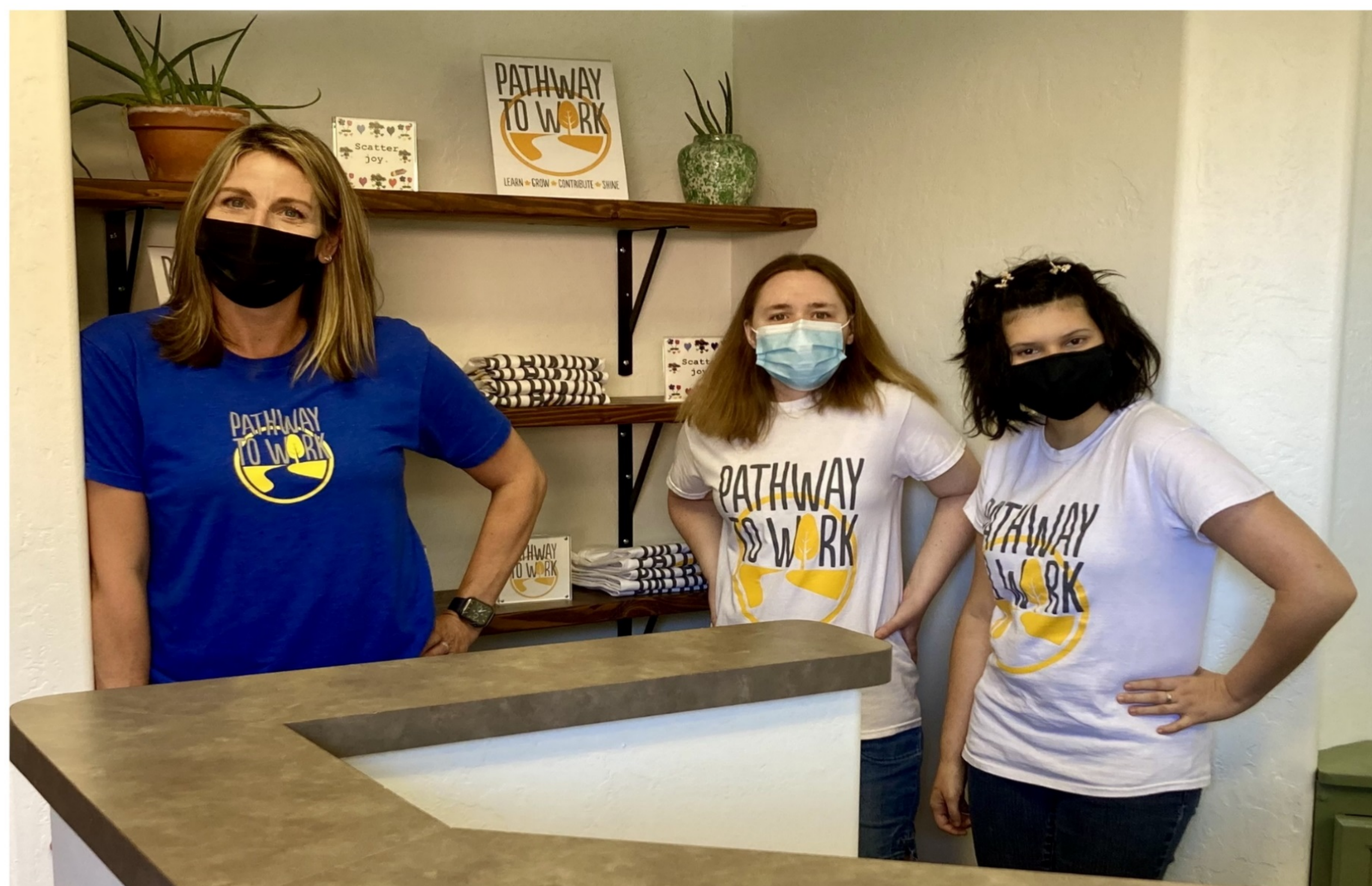
Ready to help customers at the Pathway to Work Marketplace!

Our participants' futures look bright! We are taking steps to apply for additional Vocational Rehabilitation contracts with the Arizona Department of Economic Security. We are also building a sustainable micro-business center on our property designed around inclusion, by creating employment opportunities for individuals with disabilities working alongside individuals without disabilities---a true inclusion model. This initiative also includes a Marketplace with retail employment opportunities for our participants in a integrated setting---paid at the competitive wage rate for Arizona.