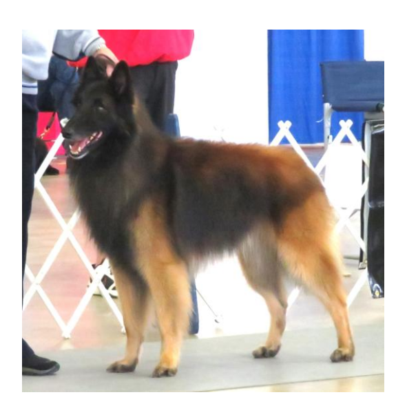
BEST OF OPPOSITE SEX CH SKY ACRES MORNING WINGS TAKE FLIGHT