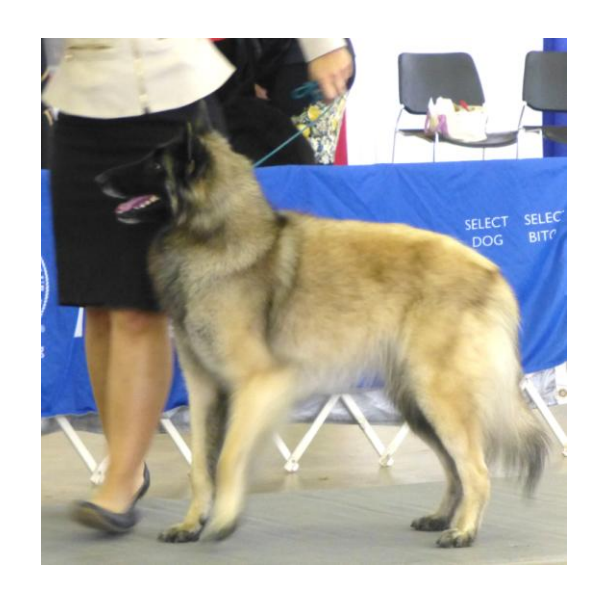
BEST OF WINNERS NOBILITY'S CHIANTI