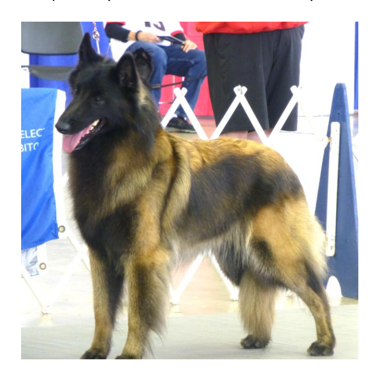
BEST OF BREED CH CIBOLA'S PIXIE FROM PETER PAN

(see Show Results, Page 5 for other dogs' names)