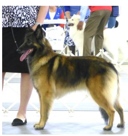
Clockwise from Upper Right (see Show Results)

Dogs: RWD, BBE 1 BBE 2 12-18 Best of Breed Competition (Bitches in Ring Order)