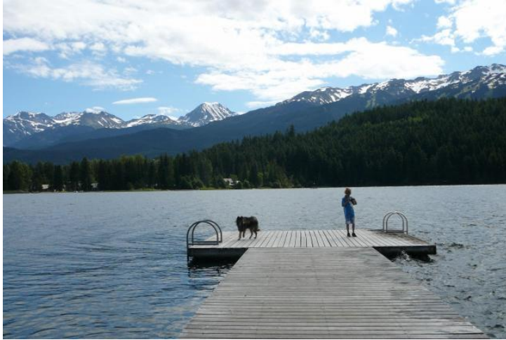
Dog Beach at Rainbow Lake, near Whistler, BC

We took the ferry across to the mainland, and drove to Whistler, British Columbia along the Sea to Sky Highway. Just beautiful. I keep repeating myself. Now I know why their license plates say "Beautiful British Columbia!"