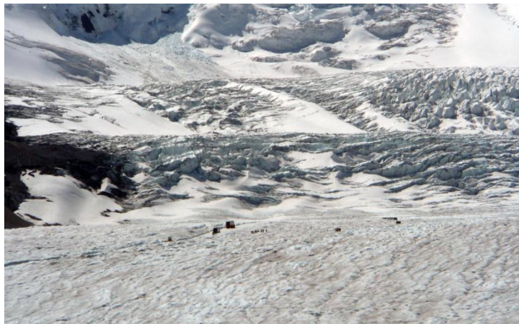
Athabasca Glacier, Jasper National Park, BC, 8/1/11 (dots are tour buses and people) Dallas high temperature - 107 degrees