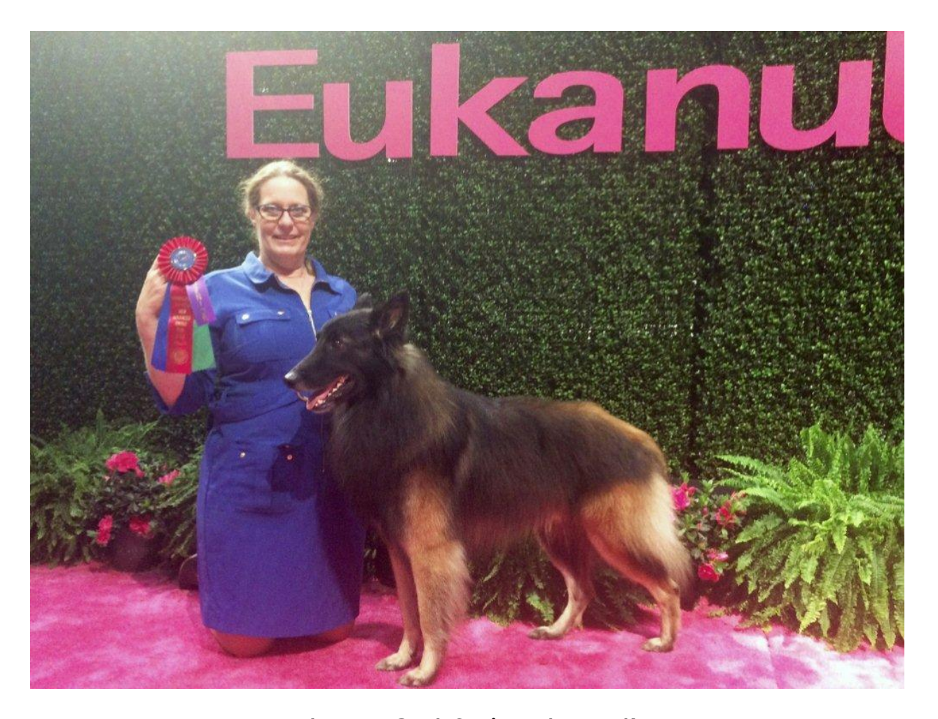
Alo--New Dock Senior Advanced!

Alo and I headed to Orlando for the Eukanuba and Royal Canin Dog shows in December. We got an invitation to compete in the National Association of Diving Dogs (NADD) National Championships and since we were there we entered the conformation shows. It was an adventure, filled with splashes, hair dryers and lots of great dog gear shopping.