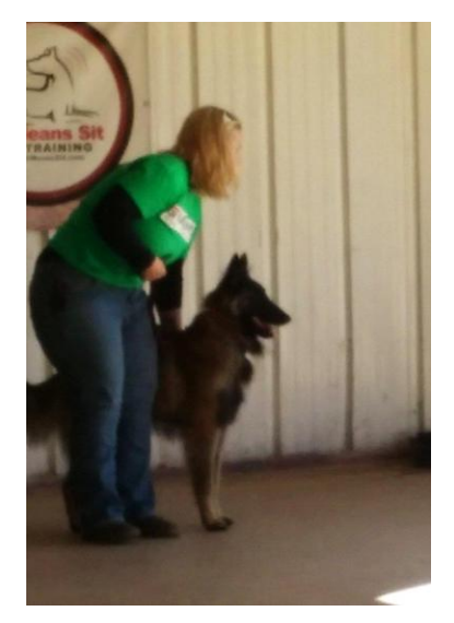
Fast forward to January 2017.

Koby has been with us for three months now. After a two month period of adjustment and work on very basic training at home, Koby and I are enrolled in formal training classes which will earn us his CGC. We cannot wait for the day we can have Koby join you all and your beautiful dogs during Conformation and Agility events.