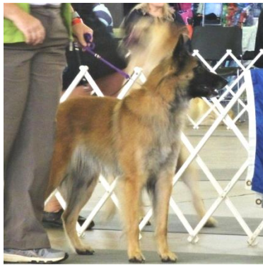
AMERICAN BRED #2 WILLOWACRES GOLD DUST WOMAN