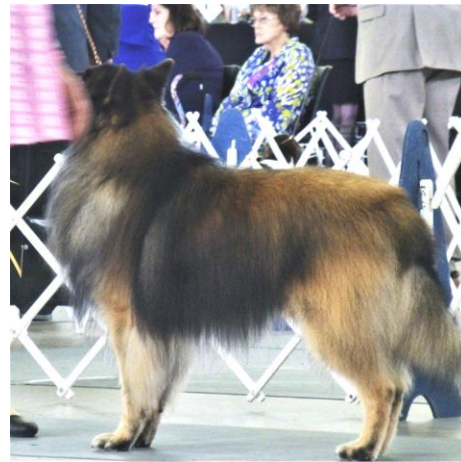
GCH CH BASQUELAINE MAKING WAVES OF GEKA CD RN BCAT CGC