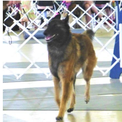
RESERVE WINNERS BITCH SKY ACRES FIRST CLASS CHARMER AT CYNFYR