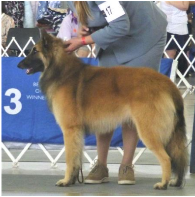
WINNERS DOG KEY WITNESS DU CADRE NOIR CGC