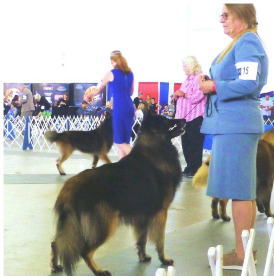
SELECT BEST OF BREED OWNER HANDLED GCH BEAU SHADO ALO DAYO DMA DSX6 CGCA