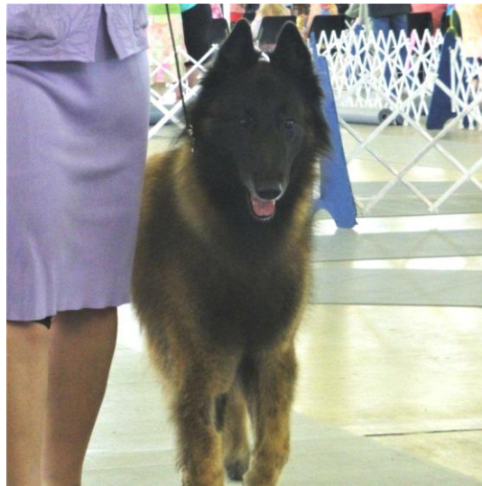
BEST OF BREED GCHB CH TACARA'S NICOLAS NTLENYANA