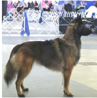
WINNERS BITCH, BEST OF WINNERS, BEST OF OPPOSITE SEX CYNFYR CHRISTMAS SURPRISE CADILLAC XLR