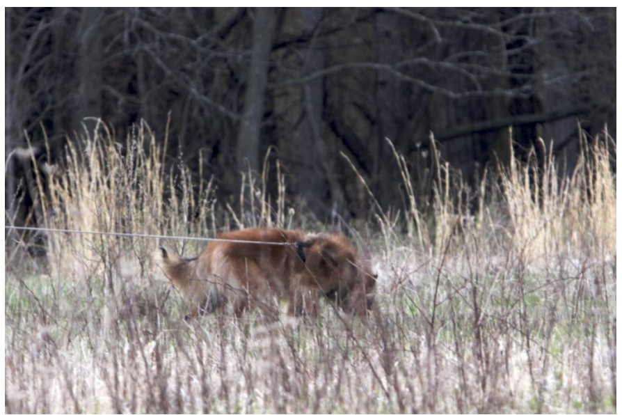
It may look like snow, but it was clumps of switchgrass

I am so proud of my Terv puppy Miles - he kept his focus in a new situation around new people and passed the TD test at the Belgian Tervuren National Specialty in northern Ohio in April 2014 to become Waldenmark Nose for Fashion Qui Rit TD! And he was barely 10 months old.