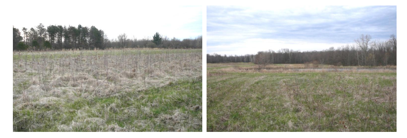
Clumps of switchgrass in bands

The judges said my track was ready to go, so I put Miles's harness on and we headed to the start. The first leg crossed bands of tall wispy clumpy switchgrass and short winter-green type grass, going directly into the rising sun with a road not far to our left. Miles was not pulling hard, and was not pulling straight, since he seemed to be weaving around the clumps of grass. Somewhere on that first leg there was a large hole. The judges had warned us that the footing wasn't good and that there were holes, but I hadn't envisioned a hole 2 feet wide. Between the sun and the bad footing I decided to watch where I was walking and let the feel of Miles' confidence in the line tell me when he was on the track.