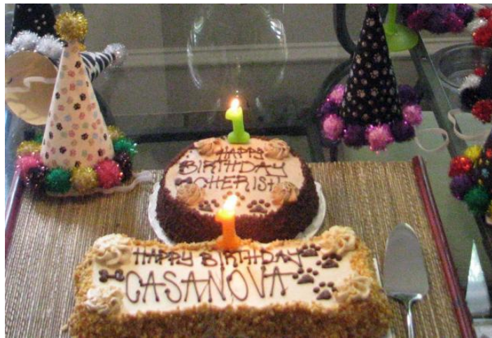
What wonderful cakes! And the human cake was out of this world!