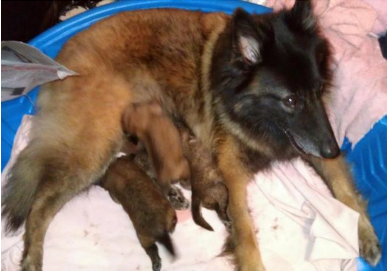
Mama "Sprint" and Babies!