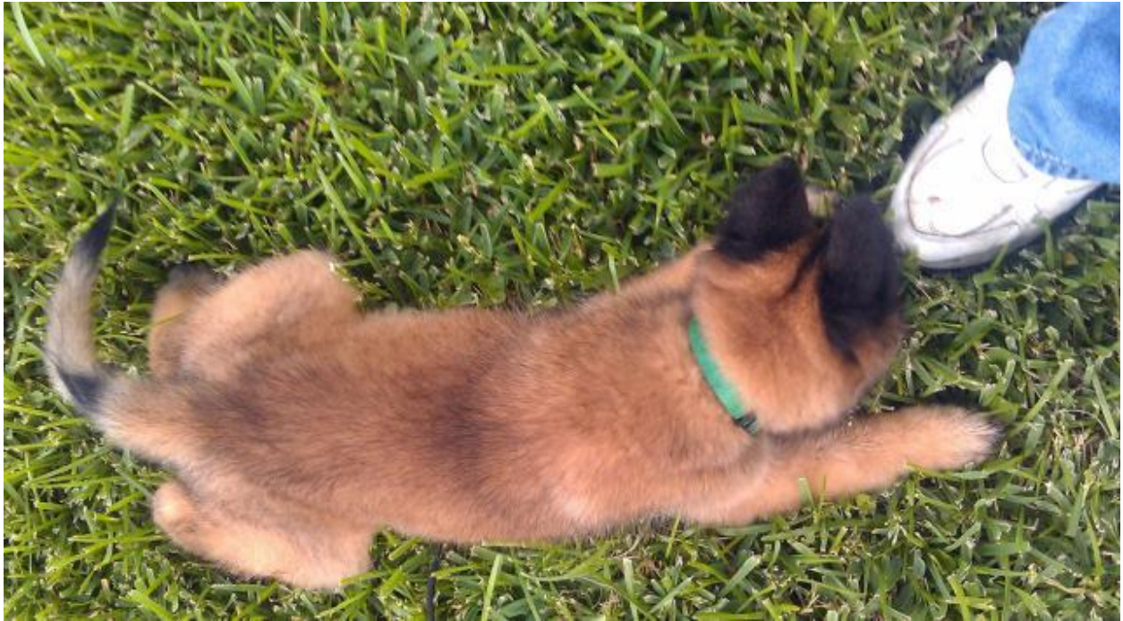
YOUNG SHOE-NIBBLER, "ZOOM"