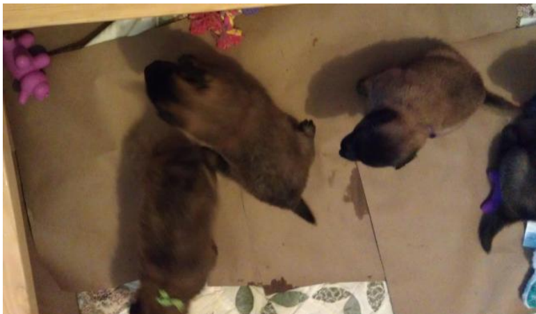
Blackfyre "K" Litter