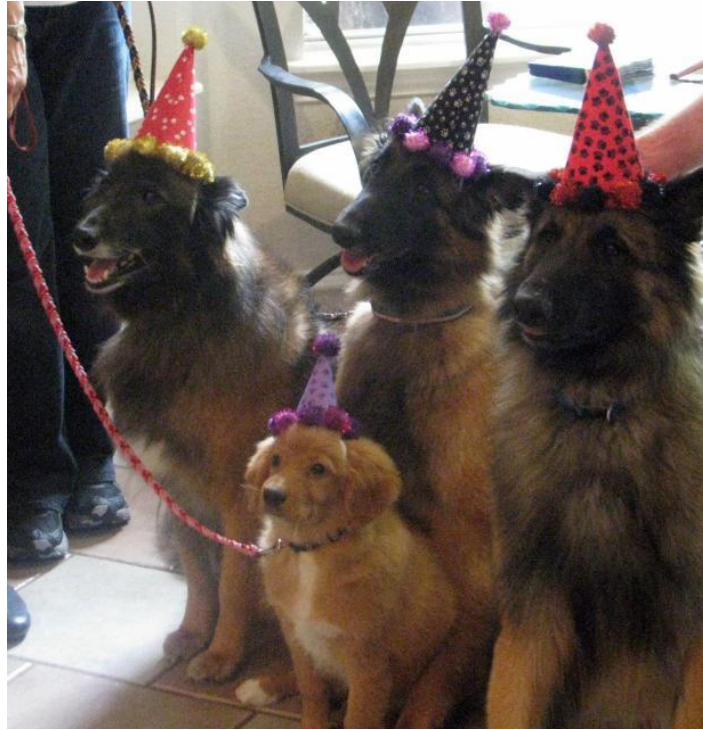
Clipper, Cherish, Casanova, and Puppy Cameo!