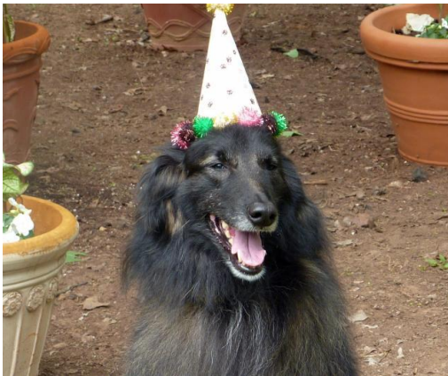
Shumaker Hill's Bendit Like Becka AX AXJ OF