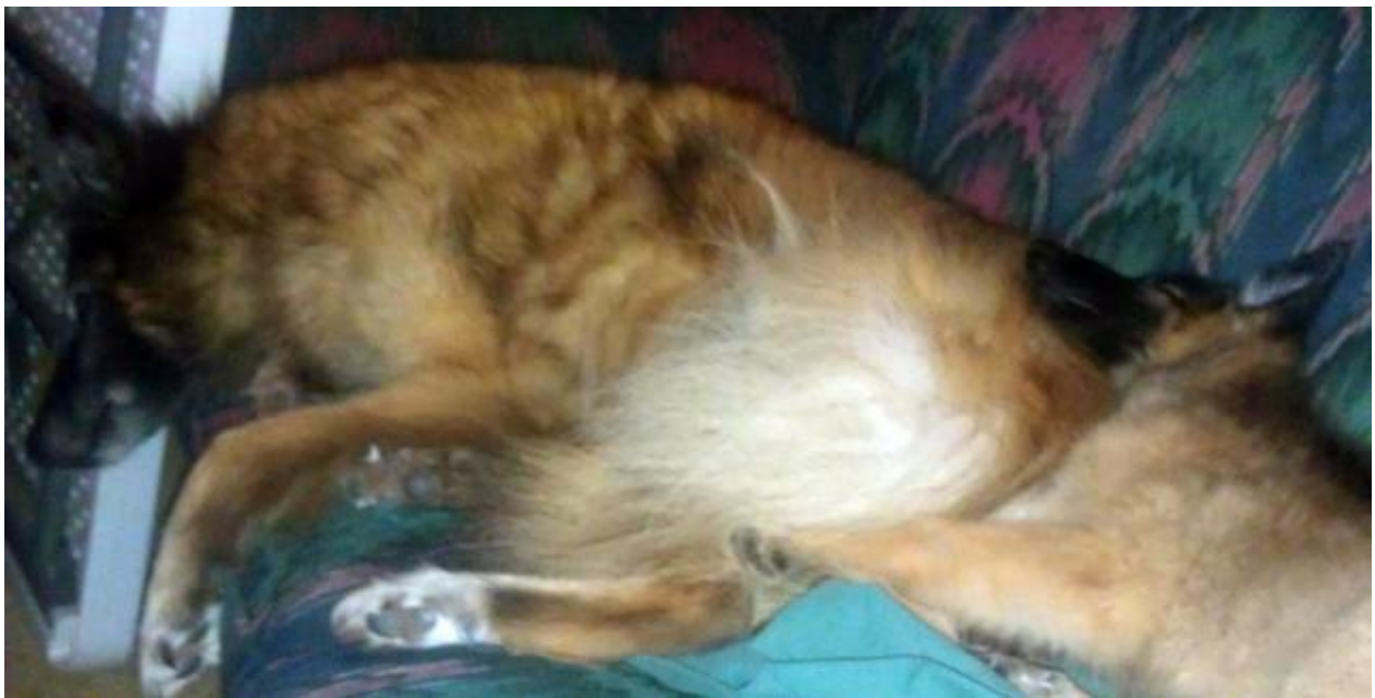
MAIZI AND ZOOM