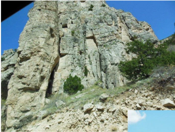
Watch for falling rocks!