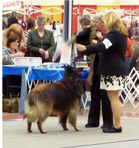
Best in Veteran Sweeps Ch. Sky Acres Flying Colors RN CD