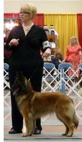
Ch. Tacaras Racelon Reine Renard