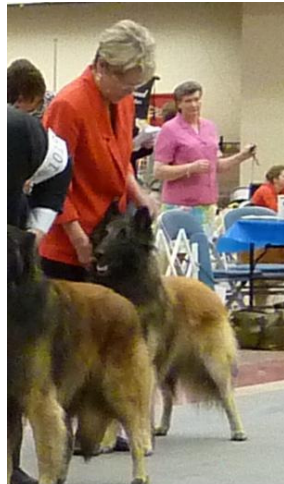
StarBright You're the One