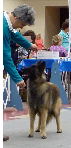
Tacaras Delphi Dreams