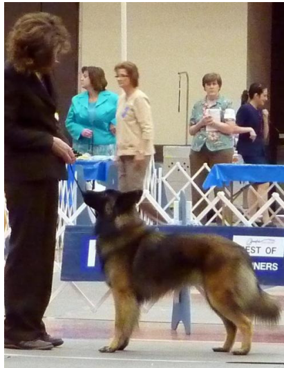
Tacara's Denali Dream