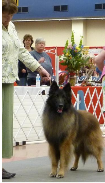
Ch. Tacara's Racelon Rembrandt NF