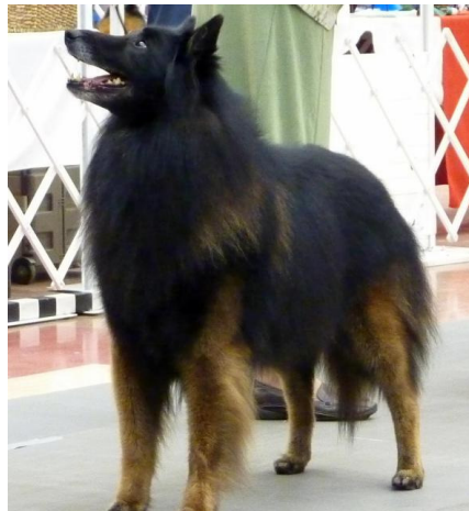
Ch. Majic's Image Maker