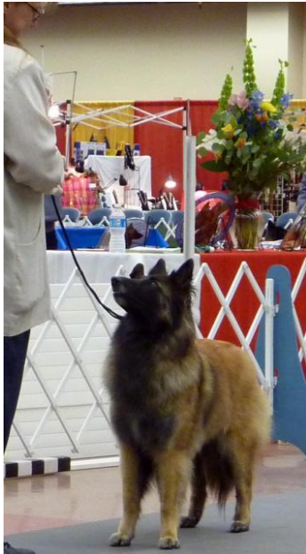
Journeyman Dance of the Rain HT