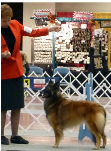
Sky Acres Cinnamon Crunch