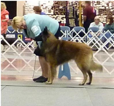
Darboshea n DK Raining Kisses