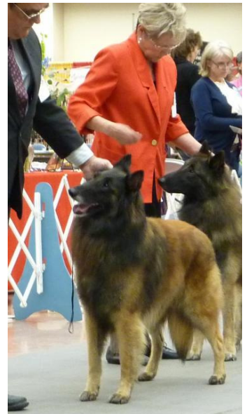
Blackwater HiAyre La Verite'