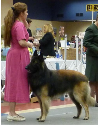
Mon Ami Cavalier Firestorm