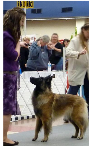
Tacaras Benevia Batavia