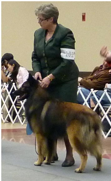
Arlequin Lone Star Cowboy Cody TD