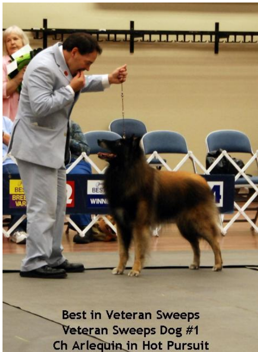
Best in Veteran Sweeps Veteran Sweeps Dog #1 Ch Arlequin in Hot Pursuit