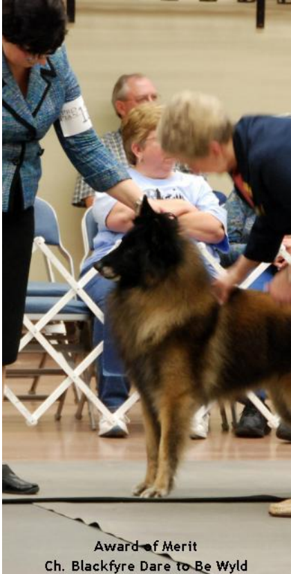
Award of Merit Ch. Blackfyre Dare to Be Wyld