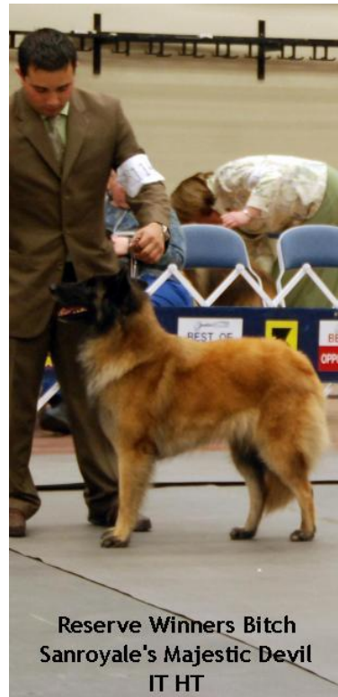
Reserve Winners Bitch Sanroyale's Majestic Devil IT HT