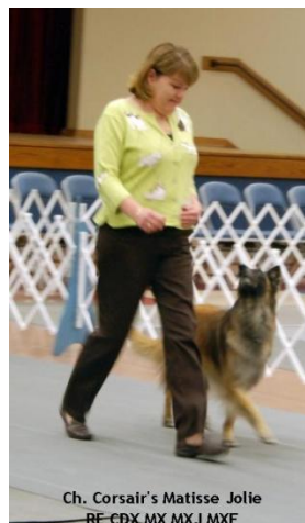
Ch. Corsair's Matisse Jolie RE CDX MX MXJ MXF