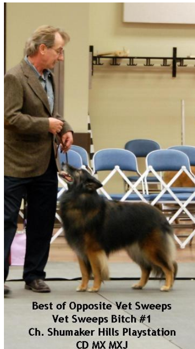
Best of Opposite Vet Sweeps Vet Sweeps Bitch #1 Ch. Shumaker Hills Playstation CD MX MXJ