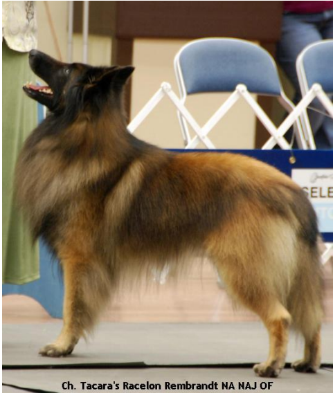
Ch. Tacara's Racelon Rembrandt NA NAJ OF