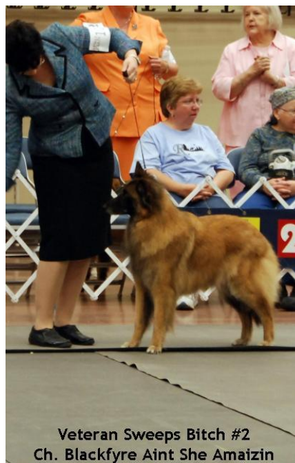
Veteran Sweeps Bitch #2 Ch. Blackfyre Aint She Amaizin