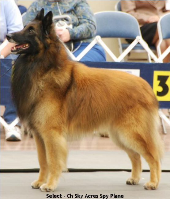
Select - Ch Sky Acres Spy Plane