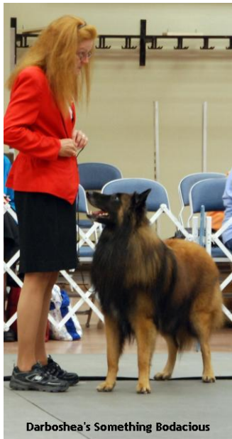
Darboshea's Something Bodacious