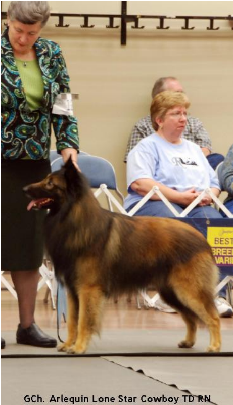
GCh. Arlequin Lone Star Cowboy TD RN