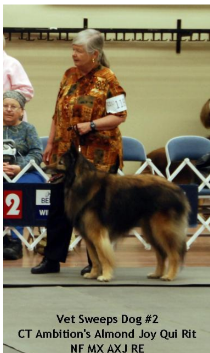
Vet Sweeps Dog #2 CT Ambition's Almond Joy Qui Rit NF MX AXJ RE