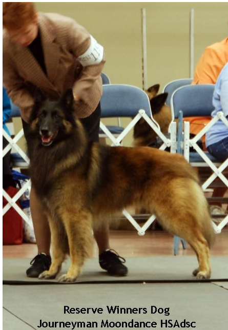
Reserve Winners Dog Journeyman Moondance HSA dsc