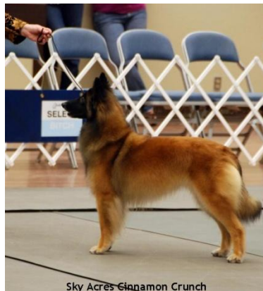
Sky Acres Cinnamon Crunch