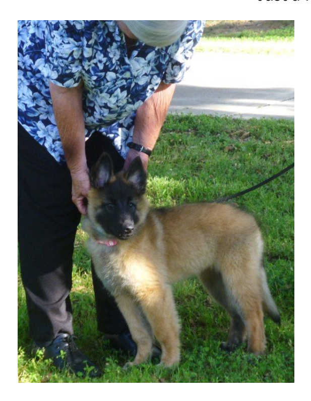
Clipper joined us after dessert!