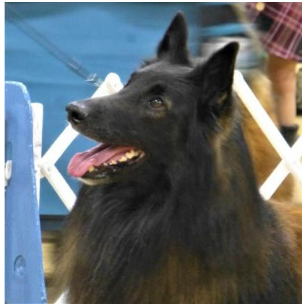
BEST OF BREED, RESERVE BIS OWNER HANDLED "Pirate"