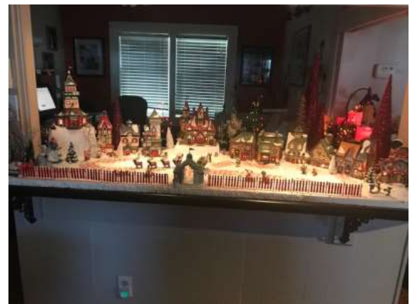
Dickens Village Place