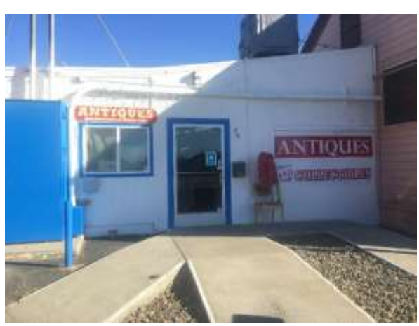
cnnslist con't next page