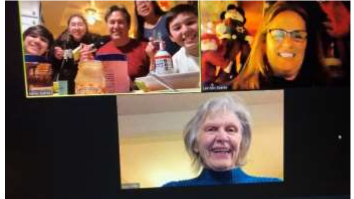
New Year's Eve