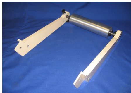
Upper Idler Assembly