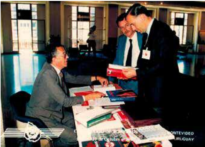
▲ Showing NFPA standards during the First Centenary Commemoration of the Uruguayan Fire Service in Montevideo in 1987.