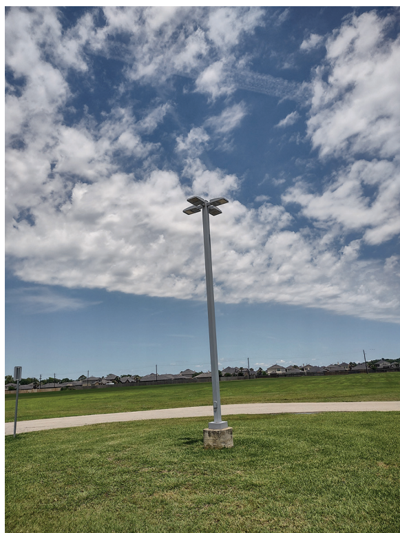
At 64 acre Park half of this fixture works