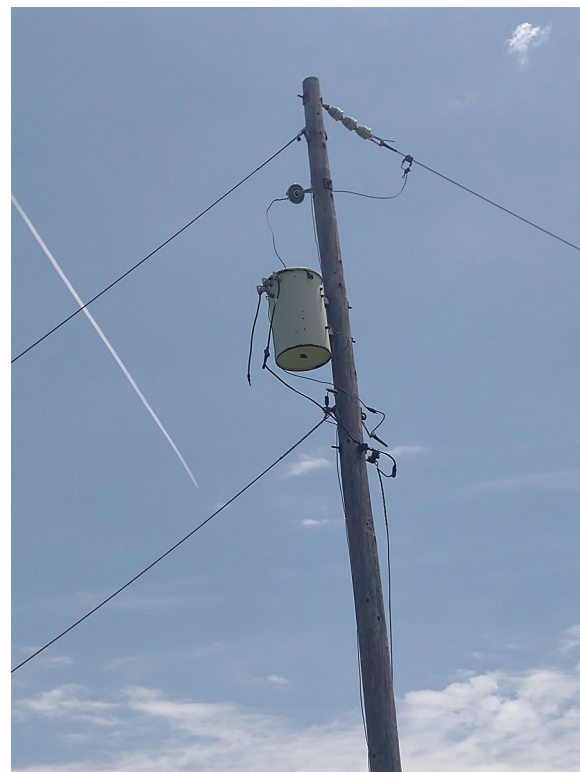
This transformer at Spillway Park used to have power and electric meter connected to it