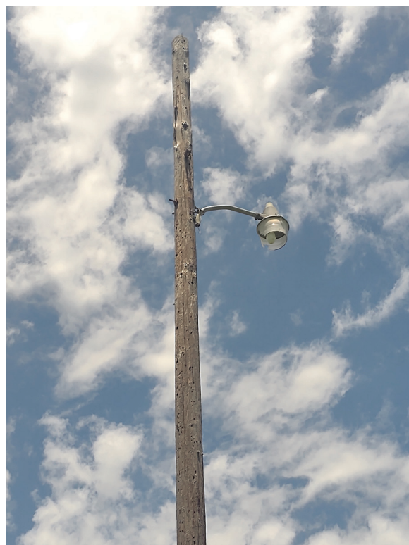
At Spillway Park this one used to have power to it