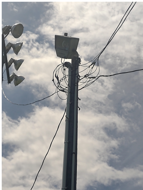
Spillway Park no surprise this area light does not work

VOLUME 31, NUMBER 10 EAGLEPOINTPRESS@YAHOO.COM EAGLEPOINTPRESS.ONLINE WEDNESDAY, MAY 7, 2025