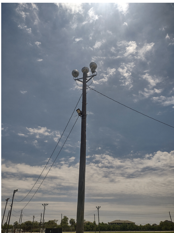
This one at Spillway Park does work