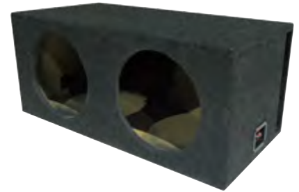
570-SPL212V for SPL1200