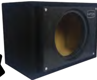
570-MAX112V for SPLMAX12