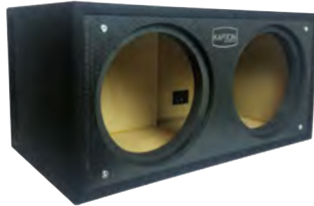
570-MAX212V for SPLMAX12

Available for Single or Dual Woofer 0.75" MDF Construction Carpet Covered Ported Terminal Cup Supplied