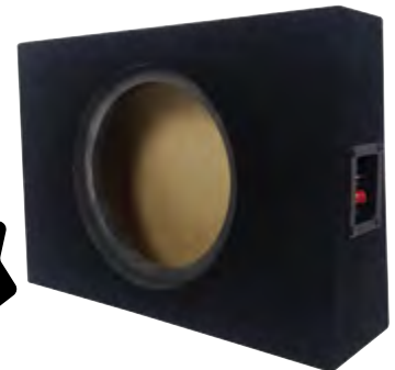
570-FW110 for SQLFW10 *5/8" MDF construction