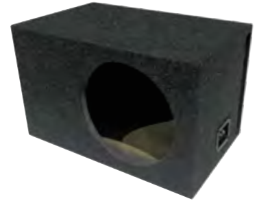
570-SPL112V for SPL1200