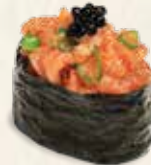
H19 Chopped Toro (Fatty Tuna) 碎蔥金槍魚腩 Sushi $5 Sashimi $6