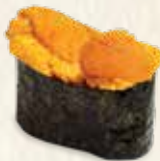
H29 Sea Urchin 海膽 Sushi $13 Sashimi $16