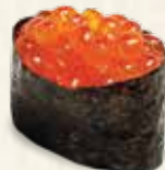
H13 Ikura (Salmon Roe) 三文魚籽 Sushi $6 Sashimi $6