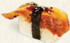
H07 Freshwater Eel 鰻魚 Sushi $3.5 Sashimi $3.5