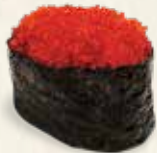
H03 Tobiko (Flying Fish Roe) 飛魚籽 Sushi $4 Sashimi $4