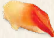
H18 Hokkigai 北極貝 Sushi $3 Sashimi $3