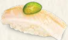
H06 Hamachi (Yellowtail) 油甘魚 Sushi $6 Sashimi $8