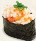
H25 Shredded Crab Meat 碎蟹肉 Sushi $4 Sashimi $6