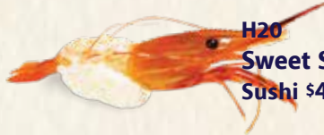
H20 Sweet Shrimp 甜蝦 Sushi $4 Sashimi $4