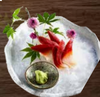
G11 Hokkigai $9.5 北極貝