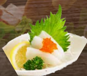
G08 Ika Sashimi $9.5 魷魚