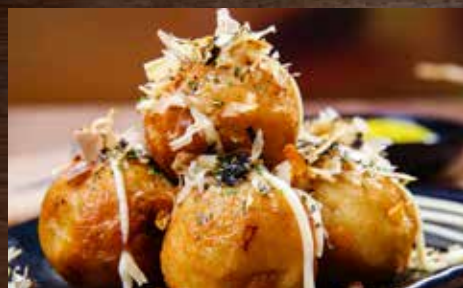
Y02 章魚小丸子 $9 Takoyaki (4pcs) Grilled octopus balls