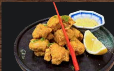
Y03 日式炸雞粒 $13 Chicken Karaage Japanese fried chicken