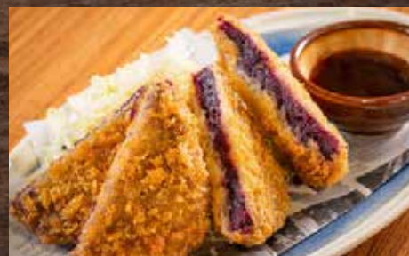
Y04 炸紫薯餅 $9 Purple Yam Croquette