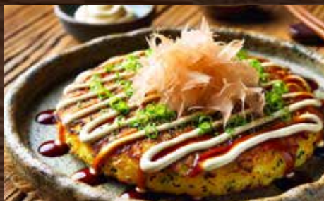
Y05 お好み焼き $9 Okonomiyaki Japanese Cabbage Pancake