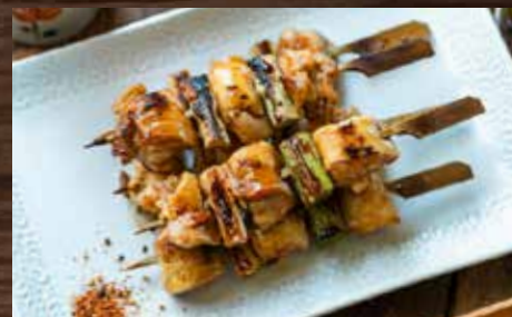
Y01 焼き鳥 $9.5 Yakitori (4 Skewers) Skewered chicken & spring onion