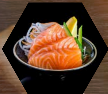
G06 Salmon Sashimi (3pcs) $12 鮭魚刺身