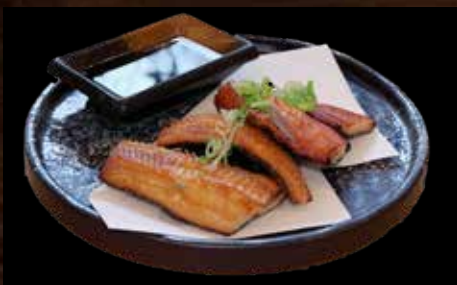
Y06 味醂烤花鮫魚 $16 Hokke Mirin-yaki Sweet Soy & mirin glazed mackerel