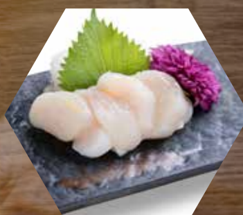
G07 Hokkaido Scallop $12 北海道帶子