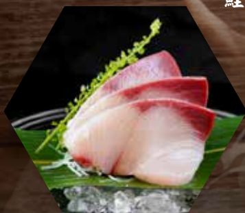
G09 Hamachi Sashimi (3pcs) $16 (Yellowtail) 油甘魚