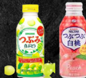
White Grape Juice