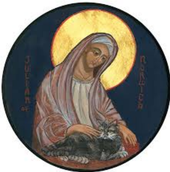
Blessed Julian of Norwich

The mother can give her child to suck of her milk, but our precious Mother Jesus can feed us with himself, and does, most courteously and most tenderly, with the blessed sacrament, which is the precious food of true life ... The mother can lay her child tenderly to her breast, but our tender Mother Jesus can lead us easily into his blessed breast through his sweet open side, and show us there a part of the godhead and of the joys of heaven, with inner certainty of endless bliss ... This fair lovely word 'mother' is so sweet and so kind in itself that it cannot truly be said of anyone or to anyone except of him and to him who is the true Mother of life and of all things. To the property of motherhood belong nature, love, wisdom, and knowledge, and this is God.