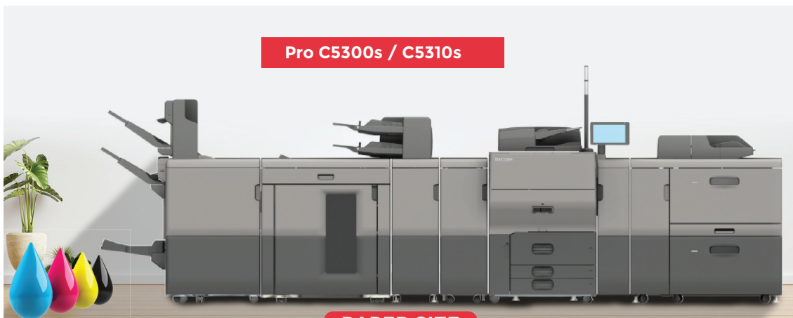
Pro C5300s / C5310s