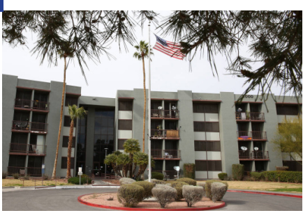
James Down Towers

Boilers: Thermal Solutions Tankless Water Heaters: Navien