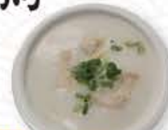
103 海鮮粥 $23.95(高) Mixed Seafood Congee (Pot)