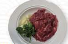
104 馳名艇仔粥 $23.95(高) Shrimp, Pork Skin & Minced Beef Congee (Pot)