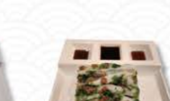
092 懷舊刮刮牛肉碎腸粉 Steamed Minced beef Rice roll (DX) with Chinese parsley & green onion