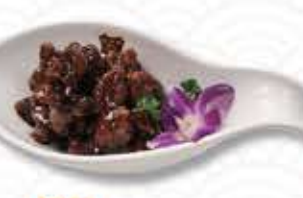
063 秘製黑醋骨 $16.95 Spareribs In Chinkiang Style