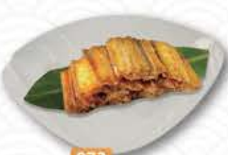
073 香煎帶魚 $16.95 Pan-fried Belt Fish