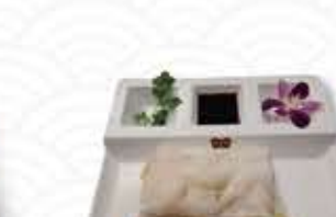
091 鮮蝦滑腸粉 Steamed Prawn Rice Roll (DX)