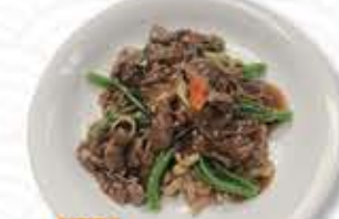
085 菜遠牛河 $22.95 Pan fried rice noodle with beef & vegetable