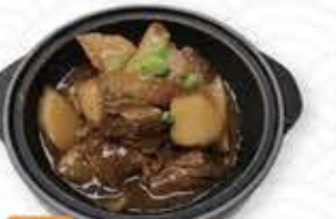
062 柱侯蘿蔔牛腩煲 $19.95 Braised Beef Brisket & Radish Hot Pot