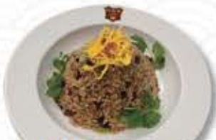
066 生炒臘味糯米飯 $16.95 Sticky rice with diced preserved meat & dry shrimp