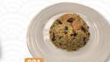
081 楊州炒飯 $18.95 Shrimp & BBQ pork fried rice