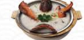
原隻龍蝦粥 (時價) Fresh Lobster Congee (Current price)