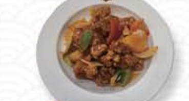
061 荔枝咕嚕肉 $16.95 Lychee Sweet and Sour Pork