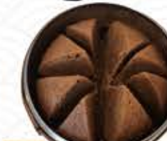
116 姜汁燉奶 Ginger Milk Pudding (M)