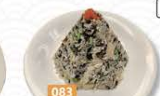
083 黑松露野米帶子炒飯 $29.95 Fried wild rice with scallop & truffle sauce