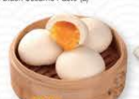
117 菠蘿奶油流沙包 pineapple oil flow sandbag (L)