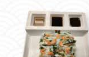
094 瑤柱香茜蔥花蝦米腸粉 Steamed rice roll w/ green onion, Chinese parsley, dried scallop & dried shrimp (DX)