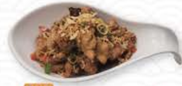
055 椒鹽雞膝 $18.95 Deep fried chicken knee with spicy salt & pepper