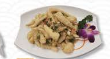
064 椒鹽鮮魷 $16.95 Deep Fried Squid with spicy salt