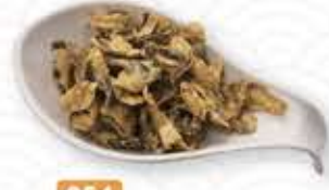
054 金沙魚皮 $17.95 Deep fried fish skin in salty egg yolk