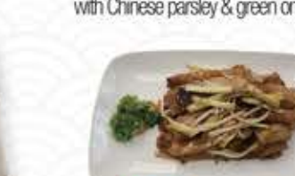
095 手拉美極煎腸粉 Pan Fried Rice Roll With Maggie Soya Sauce (DX)