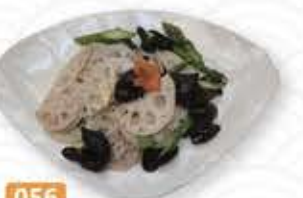
056 雲耳露筍炒蓮藕片 $16.95 Sautéed sliced lotus root with black fungus & asparagus