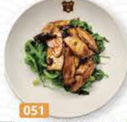
051 杏鲍菇扒豆苗 $18.95 Sautéed Pea-leaves top with king oyster mushroom