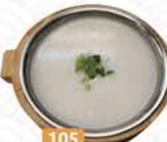
112 焦糖馬拉糕 Steamed caramel sponge cake