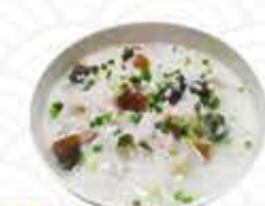
102 皮蛋瘦肉粥 $19.95(高) Century egg and pork congee