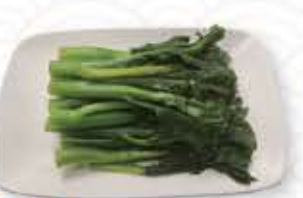
059 蠔油芥蘭 $16.95 Chinese Broccoli With Oyster Sauce