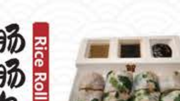
090 香脆肉鬆炸兩 Chinese Donut Rice Roll (DX)