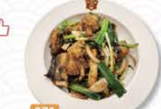
071 頭抽哈利拔 $16.95 Sautéed Halibut With Special Soya Sauce