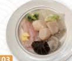
110 酥炸豆沙煎堆 Deep Fried Sesame Ball With Black Sesame Paste (L)