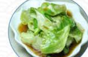
060 蠔油生菜 $12.95 lettuce with oyster sauce