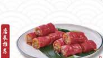
093 紅米魚茸腸粉 $12.95 Fried bread crumbs and Shrimp with Red glutinous rice Noodle Roll (DX)