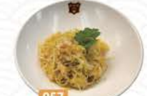
057 凉拌海蜇 $12.95 Cold Jellyfish Salad