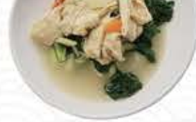
052 上湯杞子腐皮浸菜心 $16.95 Yay Choy with fish puff & wolf berry in superior stock