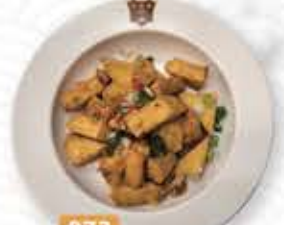
072 椒盐豆腐 $14.95 Deep Fried tofu with spicy salt