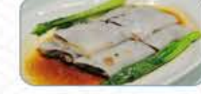
蜜汁叉燒腸粉 Barbecued pork noodles with honey sauce