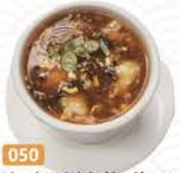
050 海皇酸辣羹(位) $9.95 Seafood Hot & Sour Soup