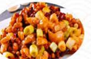
065 宮保雞丁 $18.95 Spicy diced chicken with peanuts