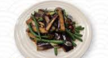
067 茄子炒四季豆 $16.95 Sautéed Eggplant & Green Bean