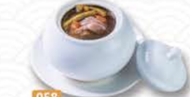
058 石斛燉雞盅 $16.95 Double boil soup with dendrobium