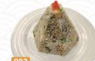
082 瑤柱蛋白炒飯 $26.95 Dried scallop & egg white fried rice