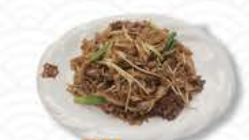
084 乾炒牛河 $19.95 Pan fried rice noodle with beef & bean spout