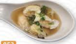
053 上湯鮮蝦水餃 $12.95 Shrimp Wonton Soup