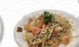
087 家鄉炒新竹米線 $19.95 Fried vermicelli with shrimp & shredded pork