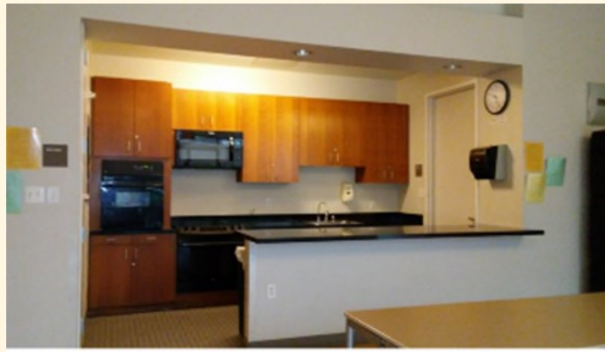
The Community Kitchen at the Plaza Hotels

I began with site tours. I went to most of the supportive housing