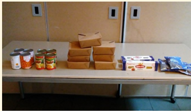
The Communal Food Sharing Table at the Plaza Hotels where residents share leftover pantry items and delivered meals with their neighbors.

food resources from doing this job for a few years, but it was really interesting to see how things shifted during COVID and how a lot more people became aware of how fragile food security can be. I think a lot more people are getting involved as the pandemic made everything feel more urgent.