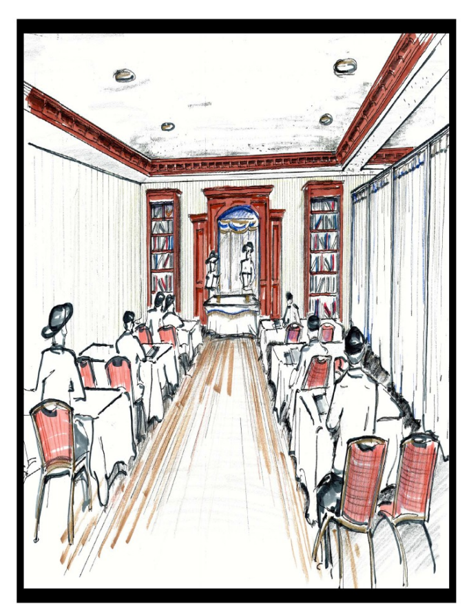
Proposed seating diagram

Young Israel of Lawrenceville has been excitedly making plans for an indoor renovation of our Shul. A beautiful brochure has been sent out – if you have not yet received one, please call the Shul and we will mail one to you. Thanks to all those who have participated so far with small and large donations, we are well underway for a successful campaign, and have reached close to TWO-THIRDS of our fundraising goal. We've also secured a reputable architect and an experienced and recommended builder to begin the work, please G-d, in November. Thanks to the generosity of so many friends and community members we have reached this far, but more