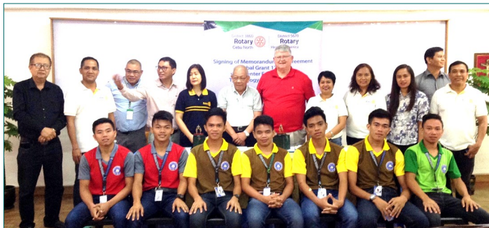
Engineering Technology Students with Host and International Rotary Clubs and CITE Faculty members

As you can see, our focus has changed from elementary students to high school and college students. I have found that this change has been most beneficial. Our efforts to support the educations of college students pay extra dividends. These young adults can find employment after graduation. In addition to this number of 33 college students, we also sponsor 6 students in an engineering technology curriculum. These students will spend 3 years in study and OJT with companies. Once graduating, they have the opportunity of spending an extra year to receive their engineering degree. These students are the “cream of the crop” and they have limitless opportunities. When asked what they will do after they graduate, all of them tell me that their first obligation is to help their family. What a great response! I am suggesting that instead of sponsoring one student for $135.00/year, we pool our donations so that many students can go to college.