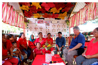
Best Center House Awardee (Village of Basak)