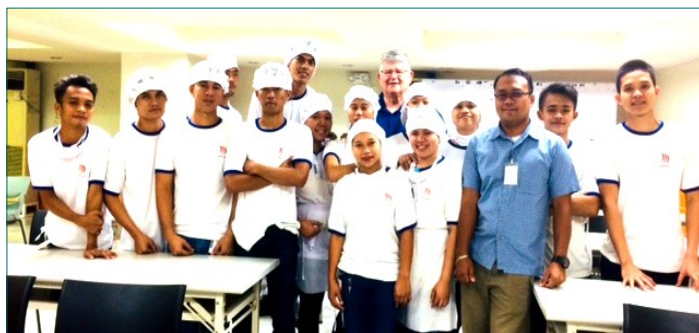
Production Technology Students with International Host club President

For those of you who are sponsoring elementary and high school students, remember that the school year in the Philippines starts in August (or whenever the virus ends), sponsorship for 2020-2021 is still the same - $135/student. Sponsoring of college students is $500.00/student.