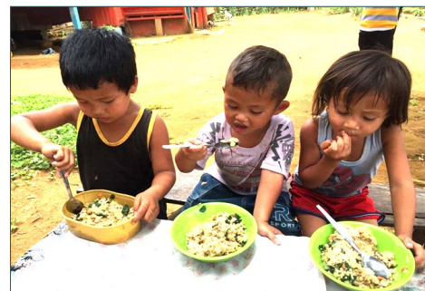
Nutritious meals served to undernourished children during feeding session.

This is not a sustainable project but vital to the work that we do with the poor. Our focus this year was on Barangay (village) Cosina. We identified 75 youngsters, ages 1-7 that were malnourished. Through nutritional education from our resident public health nurse and our feeding and nutrition program, we were able to raise the nutritional standard to normal for 52 of the children. We continue to monitor the children who did not achieve the standard weight and we provide milk, protein supplement, and vitamins to these children who have not met the nutritional standards. We also provided Health and Education Classes to 61 Mothers on topics of signs, symptoms, treatment, prevention, and home remedies for childhood diseases.