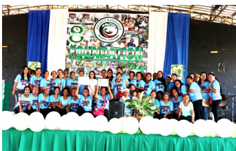
Best Performing Center Awardee (Village of Basak)