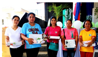
Some of the recipients of 200 minor prizes (kitchen wares)