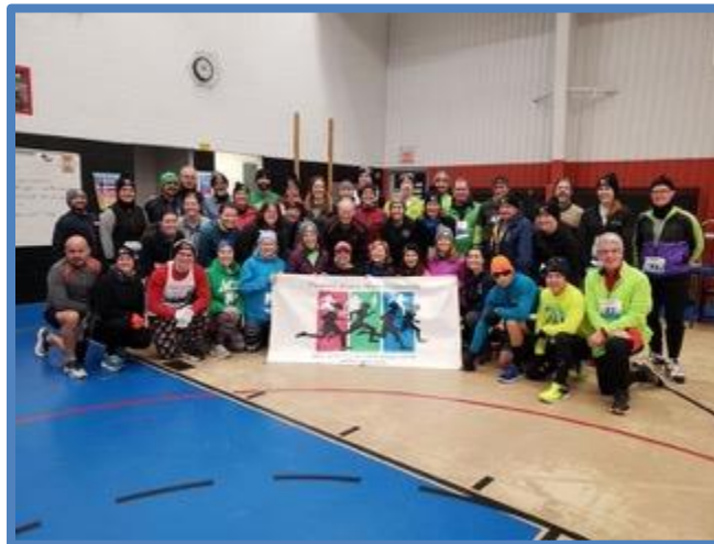
Frosty Five 2019 Group Picture

http://krrclub.x10host.com/2019/winter1f.html