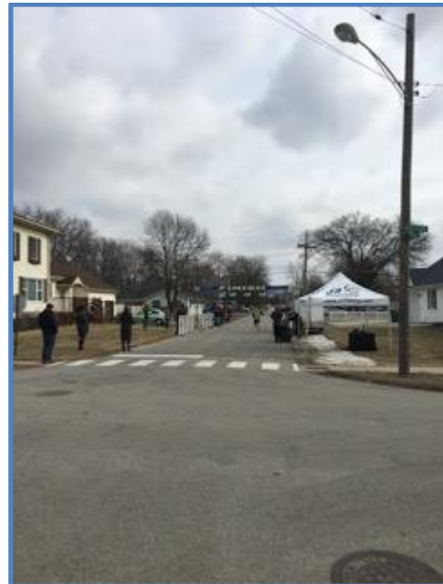
First Female and Male Runners