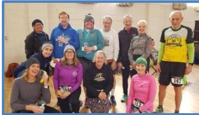
Winterfest 2019, 5kM Group Picture