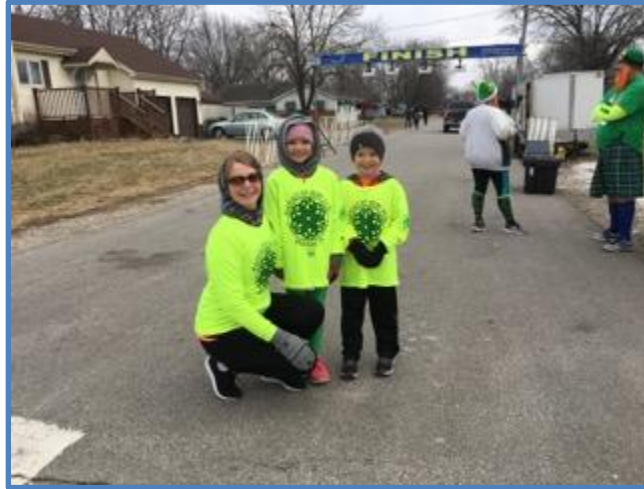
This picture titled "Three Smiler"

https://www.itsyourrace.com/results.aspx?id=7190