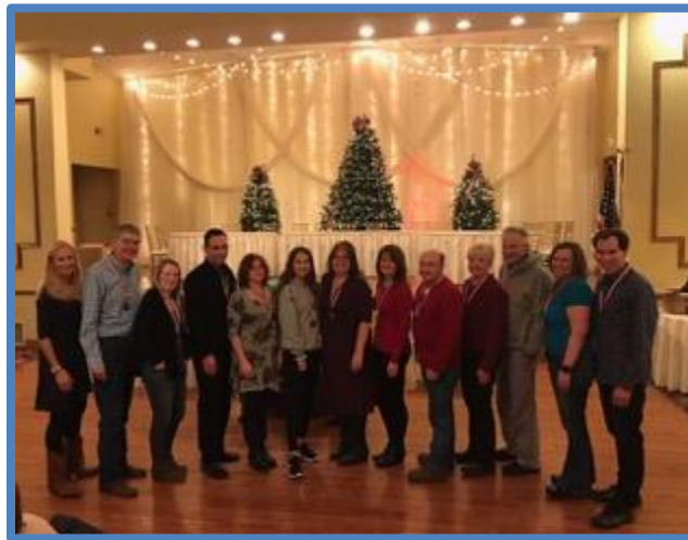
Award Winners: (LEFT to RIGHT)