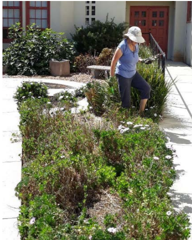
Suzanne bringing order to the Peace Garden