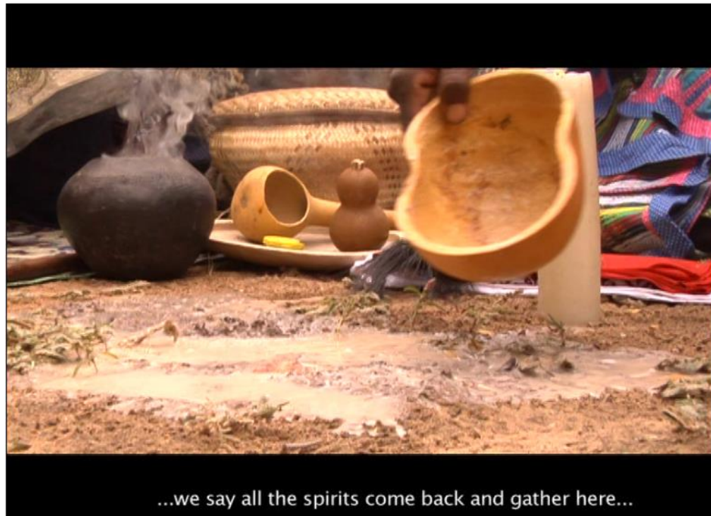
Figure 4.3 This is a screenshot from the film on the repatriation of the Mapungubwe human remains. The picture shows traditional healers performing a cleansing ritual, while calling on the spirits to gather on Mapunguwe in preparation for the reburial.