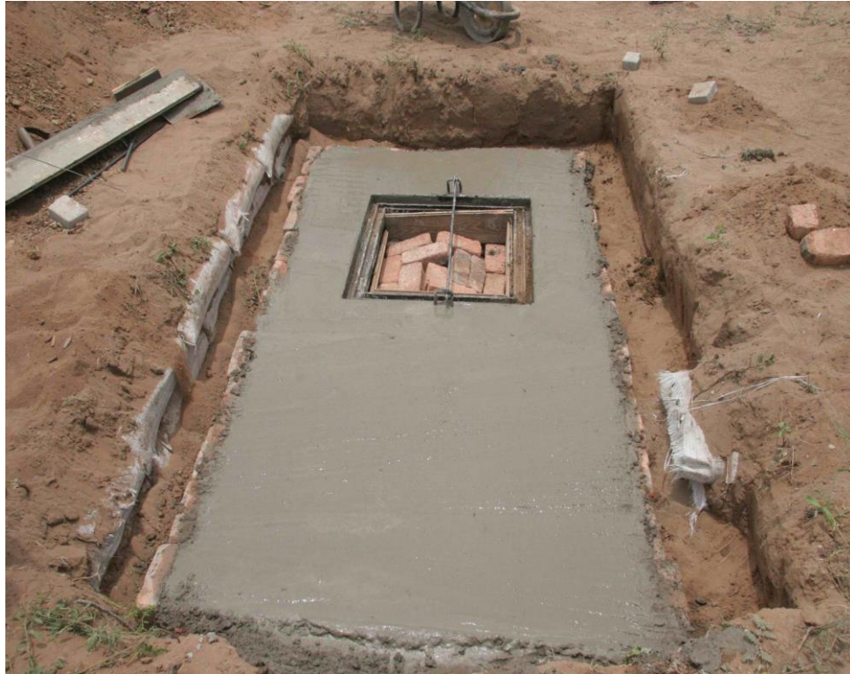
Figure 4.7 The Burial on Mapungubwe, showing the opening that was to become the manhole that would enable access for future research.

In each of the two burials, a manhole was included, with the hope that the human remains would again be available for future research, should future generations decide differently. The University of Pretoria successfully argued that the human remains were interred in the same grave so that it would be more convenient to find them, should they be sought for further research. After the concrete was poured over the graves, they each were engraved with a number and date, again for the convenience of future research. This is indicative of yet another way that the repatriation and burial process was inherently an improvisation that sought to address short-term tensions between the university and the concerned communities. The Interpretation Centre has been completed and was launched on 10 September 2012, sans the funerary objects. The objects are still under the curatorship of the University of Pretoria and appear to have been forgotten, at least for now. So far, no known effort has been made for their repatriation. The issue of the sacredness of the objects and the disconnect from their provenance has not been raised. Instead, these funerary objects are now mobilised as symbols of a romantic history of technological advancement and majesty, as demonstrated by the National Order of Mapungubwe, one of the highest national decorations. While the human remains are muted in their improvised burials, the