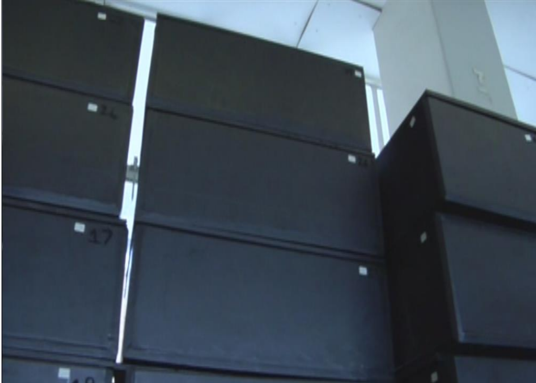
Figure 4.3 The Mapungubwe skeletal remains in numbered high density polyethylene boxes. These were prepared by the University of Pretoria's Anatomy Department, before repatriation to Mapungubwe.

The reburial of the skeletal remains in Mapungubwe was preceded by a cleansing ceremony involving traditional healers and members of the communities that claimed to be the bona fide descendents of the human remains. The cleansing ceremony, hosted by the Freedom Park Trust, and the provincial government of Limpopo, started on the 5 th of November and concluded with the “return of the spirits ceremony” on the 6 th of November 2007. Traditional healers burnt candles and impepho , a herb that is usually referred to as an equivalent of incense. They called on the ancestral spirits to bless the site and cleanse it, in preparation for the return of the human remains from Pretoria. Traditional beer, medicine and tobacco, were offered by pouring them on the ground, a way of stabilising the terrain.