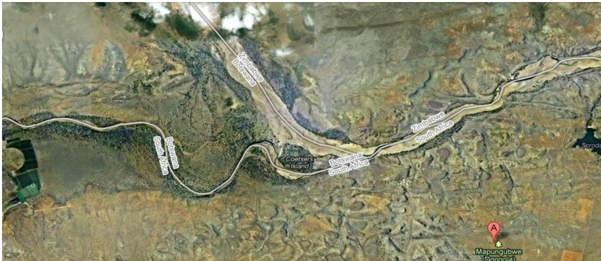
Figure 1.3 Aerial view of the location of Mapungubwe, showing the confluence of the Shashe and Limpopo rivers.

The screen shot that follows is drawn from Google Maps and it gives an aerial view of the location of Mapungubwe on the farm Greefswald, in the Limpopo Province of South Africa. The site is on the confluence of the Limpopo and Shashe rivers, where the borders of South Africa, Zimbabwe and Botswana meet (figure 1.3). The climate in the area is dry and arid, with extremely high temperatures during the warm seasons. Mapungubwe Hill is situated in a valley that is surrounded by sandstone cliffs. The summit of the hill is covered in archaeological deposit and has stone walling and a large number of burials with golden objects were excavated from the top of the hill.