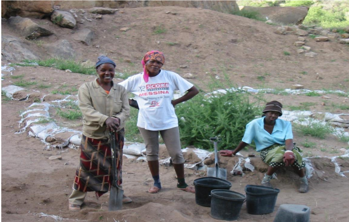
Figure 4.1 Local women during the Rehabilitation and Stabilisation of Mapungubwe Project , in 2003. The women were part of the Department of Environmental Affairs and Tourism (DEAT) Poverty Alleviation Project for South African National Parks. Their function was to carry sand buckets from the area that the research team from the University of Pretoria was working, the soil was in turn used in the construction that was taking place simultaneously.