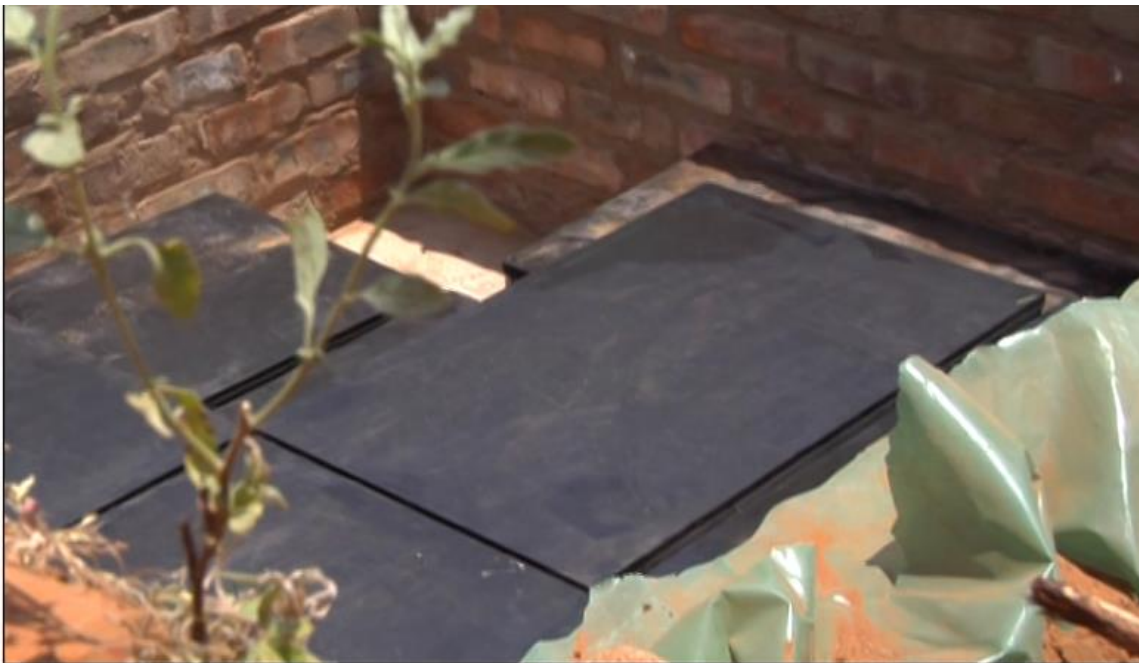
Figure 4.6 The grave on Mapungubwe Hill, showing the neatly stacked boxes containing human remains. The manner in which they were interred led some claimants to regard these burials as mass burials.