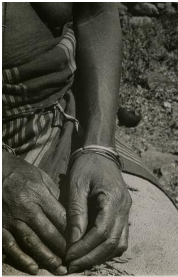
Figure 2.6 A Lemba woman wearing a golden bracelet. Dated, 1934.