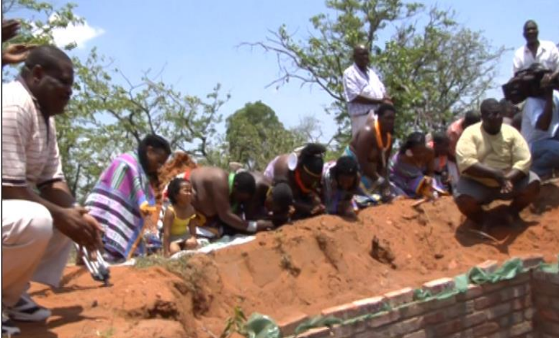
Figure 4.5 The Reburial Ceremony in Mapungubwe: Claimants are seen gathered around the grave that has been prepared for the interment of the human remains. The people seated around the grave are chanting, calling upon the ancestors to bless the space and to facilitate the return of the ancestral spirits to their resting place.