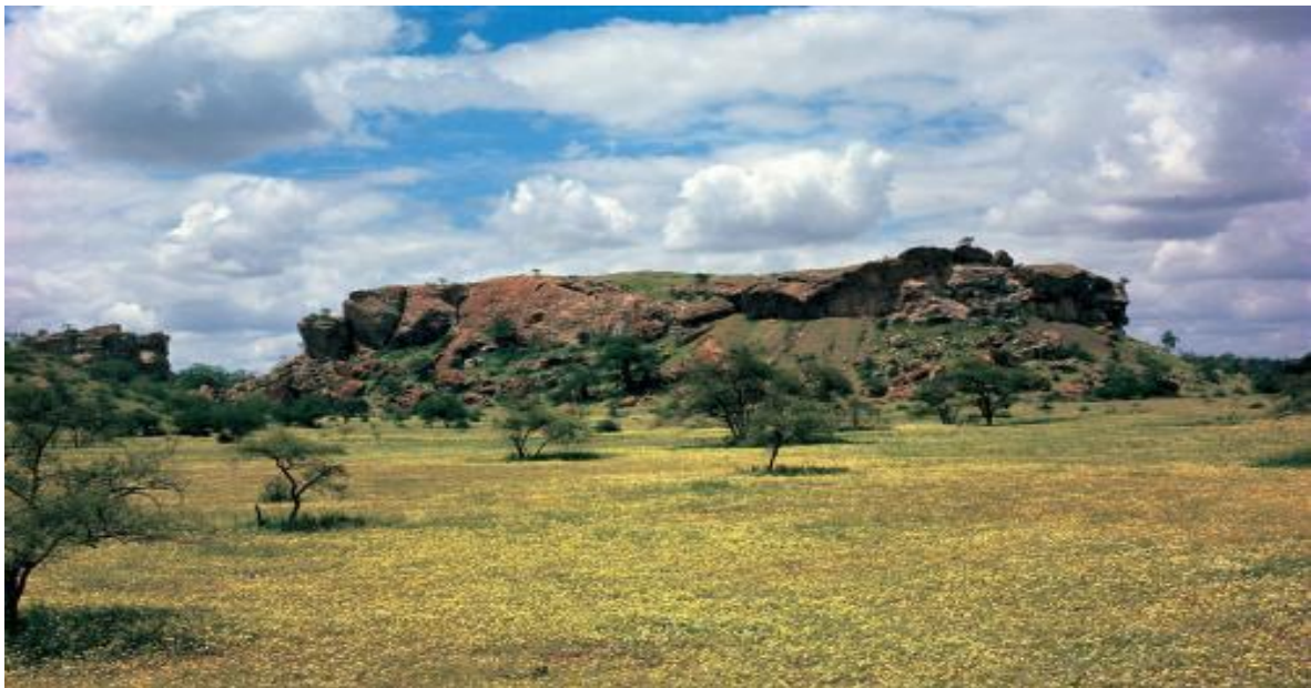
Figure 1.4 Mapungubwe Hill.