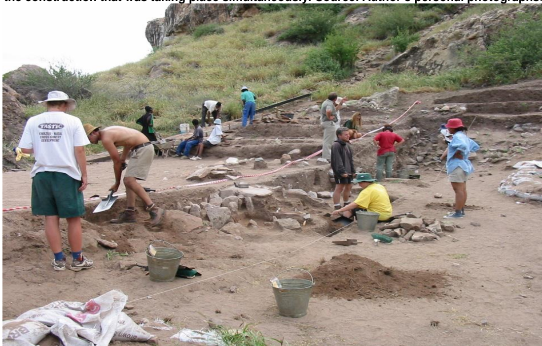
Figure 4.2 Staff and students from the University of Pretoria during the Mapungubwe Rehabilitation and Stabilisation Project that took place in March 2003. The construction workers in the background are building the staircase to the hill summit, while university team, at the fore is stabilising the trenches at the foot of Mapungubwe Hill. Source: Author's personal photographs.