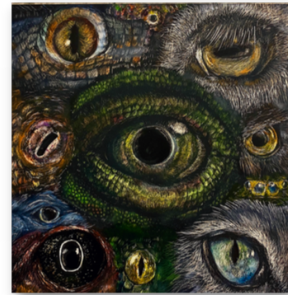
'Eyes of Biodiversity' 5x5 Scratchboard and Oil Paint

DISPLAYING DIFFERENT, OVERLAPPING SUBJECTS IN ONE SPACE TO SHOWCASE AN ELEMENT OF SDG 15