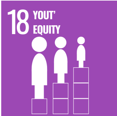
De suggested SDG 18 Youth Equity symbol

Chingas, de future of dis world ain't sustainable, if de road for us yout' ain't clear.