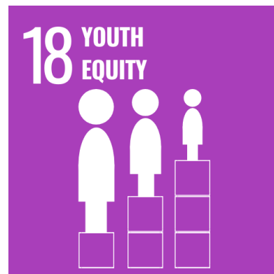
Our proposed SDG 18 Youth Equity icon

The Future of the World Is Unsustainable if the Future for Youth Is Uncertain