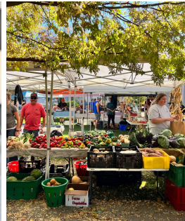
Weekly farmers market