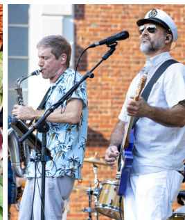
Anchor Management performing at the FUNraiser in September