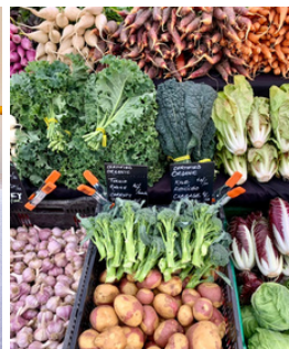
Vegetables from Helmstead Farm on display at our weekly Saturday farmers market