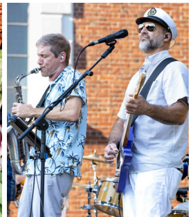
Anchor Management performing at the FUNraiser in September