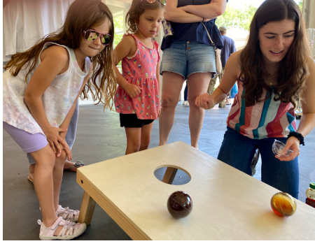
science activities for kids!