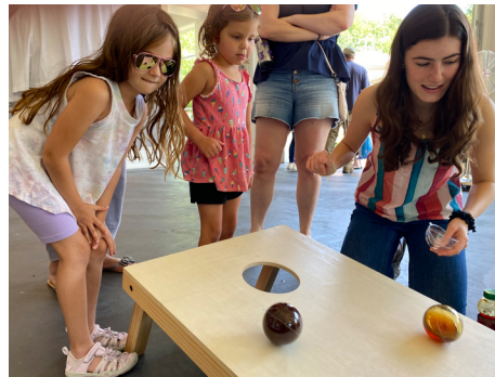
Education and fun intersect during the summer