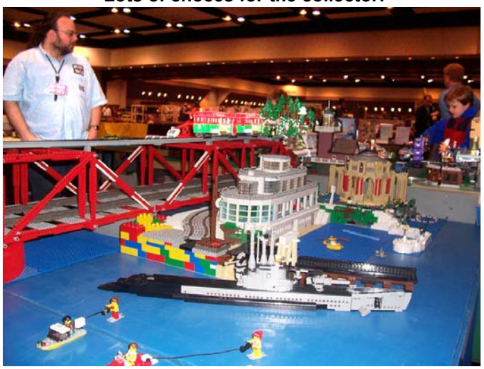
LEGO layout wonderland