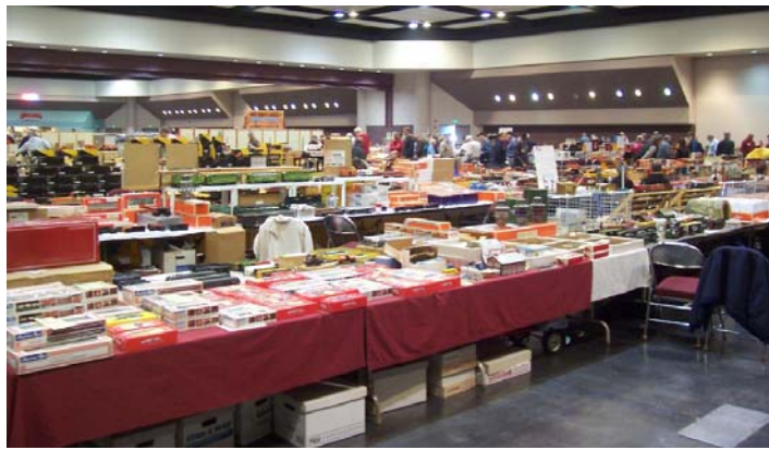
A general view of the hall