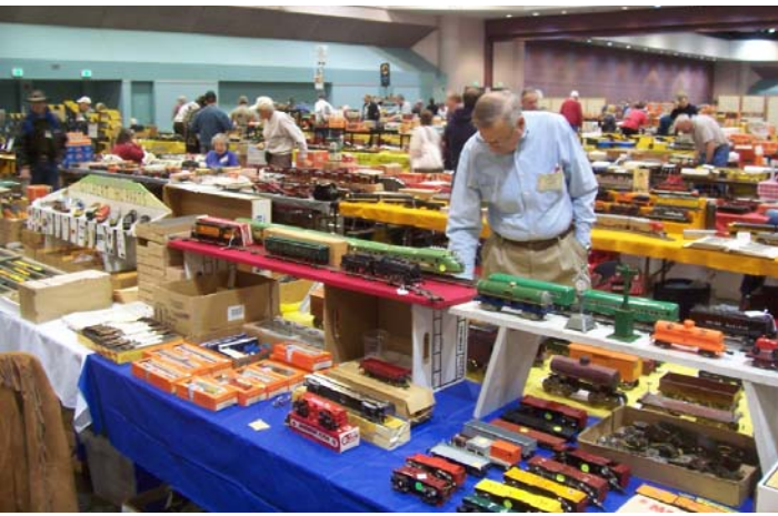
Lots of choces for the collector!