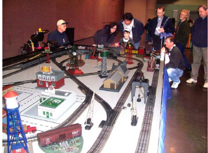
Admirers of one of the O-gauge display layouts