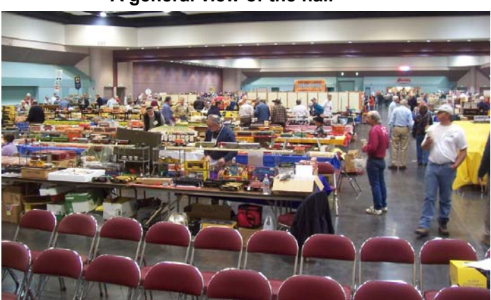
Looking from the auction area