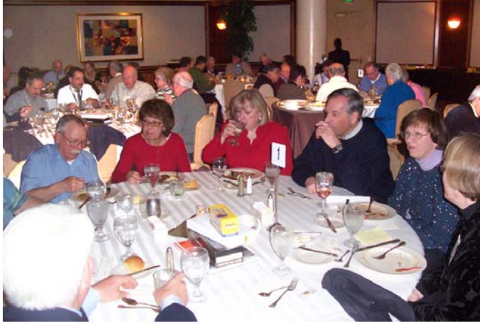
At the Saturday evening Banquet.