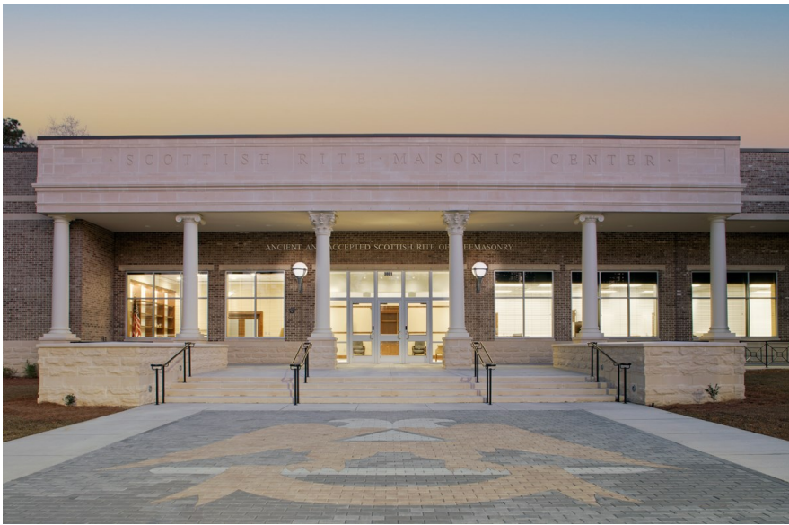
Scottish Rite Masonic Center 3001 Chatham Center Drive Savannah, GA 31405 912-232-5135