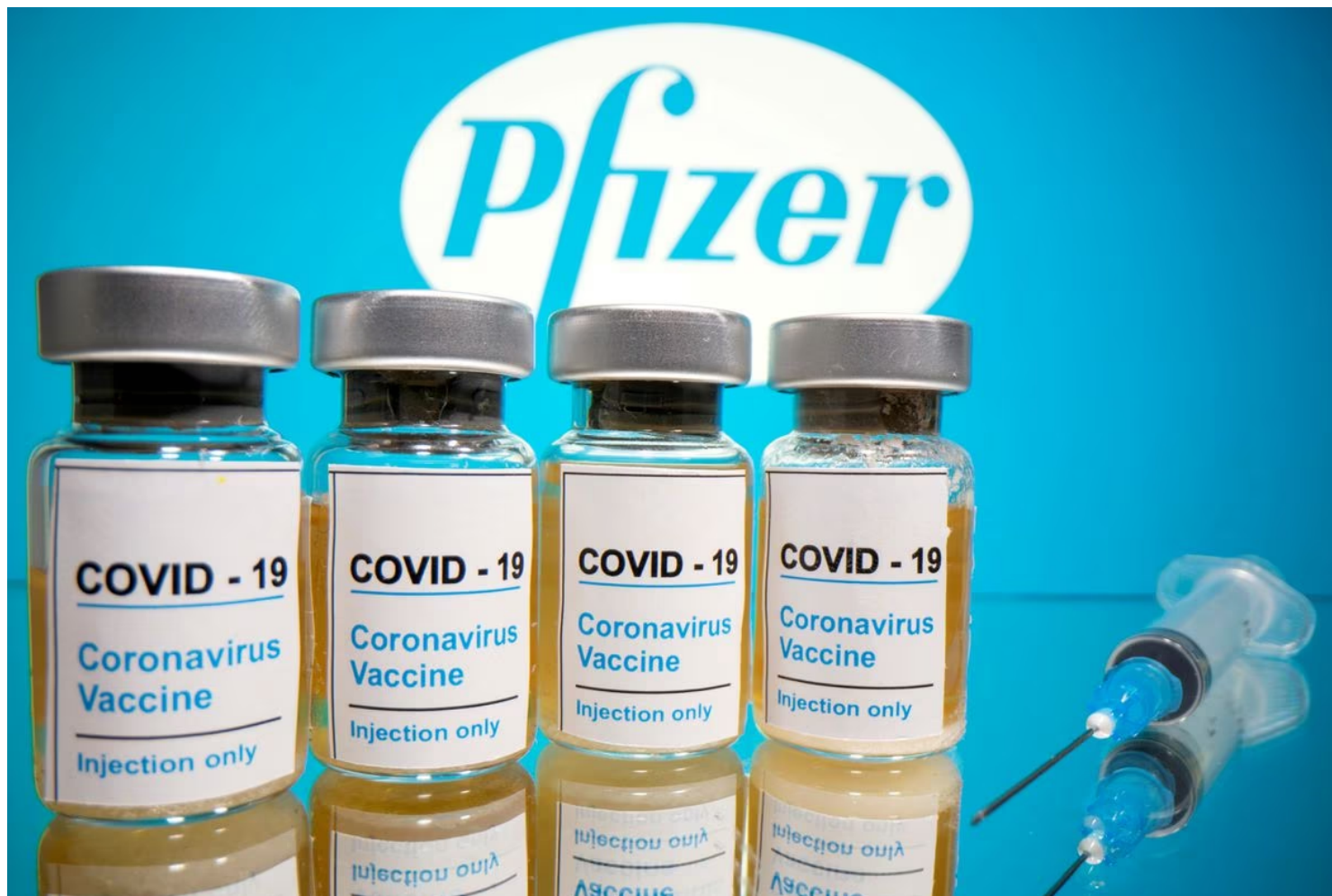
Vials with a sticker reading, "COVID-19 / Coronavirus vaccine / Injection only" and a medical syringe are seen in front of a displayed Pfizer logo in this illustration taken October 31, 2020.