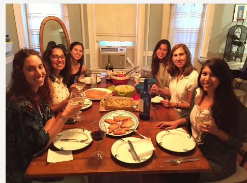
Family Dinner in Boston, MA