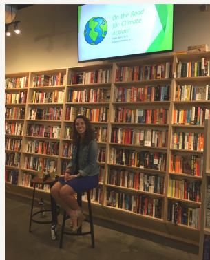
At Solid State Books, D.C.

merged directly into us on the I95 South. We couldn't have been happier to arrive to Richmond, VA, in one piece, where we had a fun-filled afternoon and our most unique event yet. The event was sponsored by a health care company, and was kicked off with wine, appetizers, and two