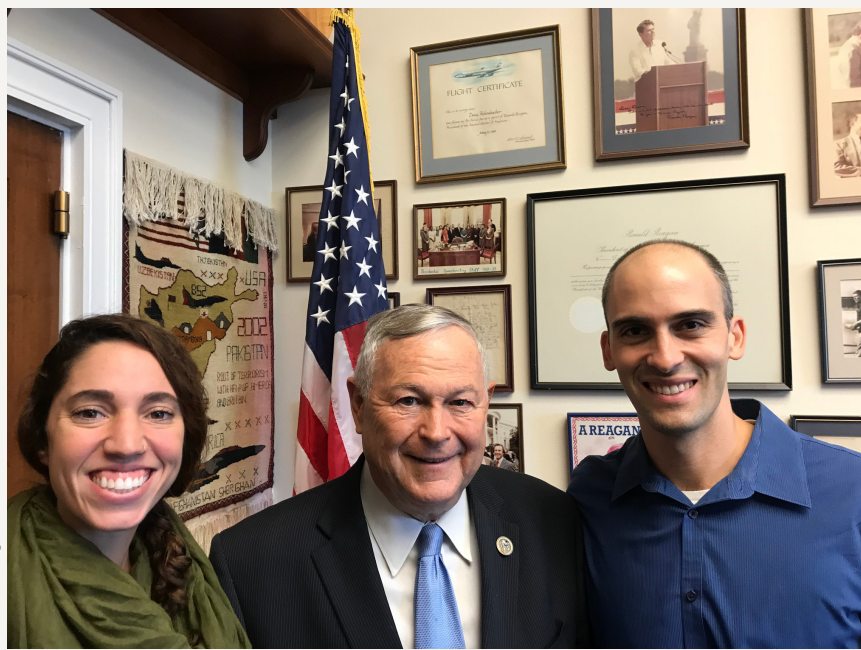
Congressman Dana Rohrabacher of district 48 in CA

inspiration with nearly 40 attendees. The event raffled off copies of Beyond Debate and Lobo Marino CD's. After the event, we headed to a local brewery with the CCL organizers! Following our visit to VA, we headed south through the Carolinas. Our North Carolina event was canceled weeks ago due to hurricane Florence. With no event, we decided to instead investigate the damage in the area and pulled off at Lumberton, NC. Though much of the debris had been raked into piles, we nonetheless saw major flooding near the river, with park benches still under water. Sunday we had a great event at