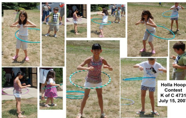
Holla Hoop Contest K of C 4731 July 15, 2007