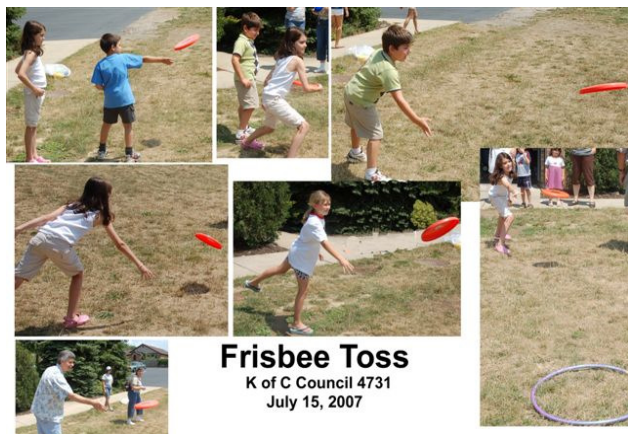
Frisbee Toss K of C Council 4731 July 15, 2007

← As you can see the picnic was for the young.