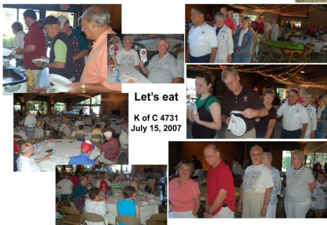
Let's eat K of C 4731 July 15, 2007